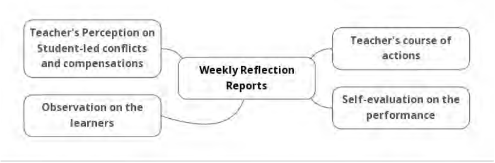
Fig. 2. Weekly reflection reports- emerging themes

As for the System-related network, there have been two main features observed to be interfering with CM: Internet Connection , and Computer-related as seen in Table 5. Internet connection issues were typically unforeseen, but they were attempted to be tolerated quickly by the teacher. For instance, when the internet connection got unstable and the voice of the student was lagging, another student was given permission to speak rather than waiting for the same student to resolve the connection problem and reply. However, there were a few times when the teacher's internet connection was unstable, thus she was dropped out of the session. This was potentially distracting since the host became another student and the students would go haywire over the screensharing of that host student. As expected, it took quite a time to calm the students down and get the learning atmosphere back when the teacher came back as a host. On the other hand, Computer-related challenges such as running slow, and lagging were often resolved with the help of Soother role of the teacher.