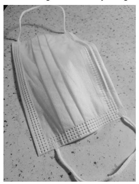
Fig.11. "The Maskeeters" (P4)

Regarding the collegial relations during the online education process, most participants agreed that it was difficult to get in touch, communicate and find a middle ground with the colleagues at the beginning during the emergency remote education process, but things got better in time. The participants stated that they had limited contact with colleagues at the beginning because no one knew what they would do, and they needed space considering the health crisis newly emerged at those times. However, as some participants mentioned, this limited contact turned into a unique collaboration among colleagues, which they did not have this much in face-to-face education. One of the participants, P4, reflected on how s/he felt at the beginning and the transition period of the collegial relations by using a mask metaphor: