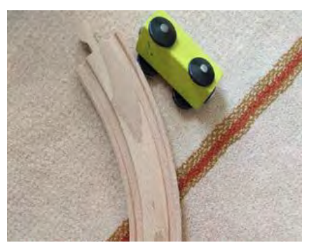
Fig.3. "Derailed" (P.2)

responsibilities is difficult enough even in face-to-face education, it is not surprising that teachers feel drained trying to manage the time to work things out both for work and for family or home. The metaphoric image of a derailed train below in Figure 3 and the abstract that accompanied it shows how a parent-teacher with administrative duties at school has been feeling during this period: