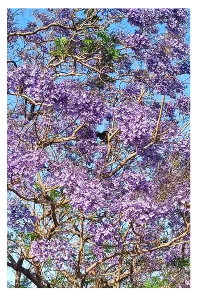
Fig.14. "To jacaranda or not to jacaranda" (P5)

Focusing on the emotional labor aspect of that situation, another participant stated s/he could not feel safe as a teacher at this institution anymore due to the uncertainties. As mentioned by other participants, too, what was expected from the administration was mostly nothing more than showing empathy by saying "We got you! You are not alone!" as noone was expecting to be provided with everything they needed in a very short time (P1).