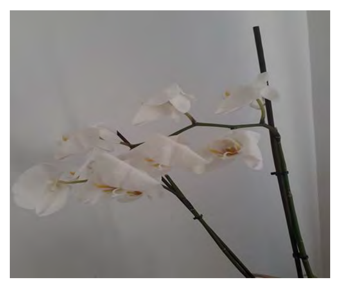
Fig.8. "Fading like a flower" (P6)

Similar positive views were shared by P4, who was following her/his PhD studies during this period. S/he indicated that she felt lucky taking her PhD courses online without commuting to another university, one or two hours away from where she lives. On the other hand, another participant, who was trying to finish her MA thesis, stated that since the beginning of the pandemic period, s/he had faced many challenges such as difficulties in collecting data, loss of motivation, and increased workload interfering with the academic studies. Considering the experiences s/he has had as a researcher during this process, s/he used the photograph of wilted flowers to show how s/he has been feeling lately and explained her/his emotions as follows: