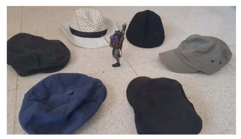
Fig.1. "A hero with too many hats" P7.

"I took this photo because I believe it describes how I feel during these unfortunate times. Each hat describes a role of mine, and the ninja in the middle shows how much of a hero I have to be to deal with all of the responsibilities at the same time." (P7)