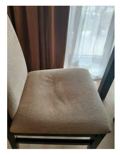
Fig.2. "Pain in the ass" (P4)

"Working from home was something we had been seeing in our coursebooks and I was like "Wow, look at these people! How flexible they are. It must be really nice to work like this..." Although the idea of "flexibility" and "working from your happy place" sounded quite charming at the beginning, I later realized that it was only the honeymoon stage. Similar to the feeling you get when you sit on a comfy chair, you get the sense of comfort and flexibility only at the beginning. Then, with all the tensions, difficulties, challenges, the unknown and the uncontrollable, you lose the sense of work-life balance and it turns into a real trouble, or pain in the ass" (P4).