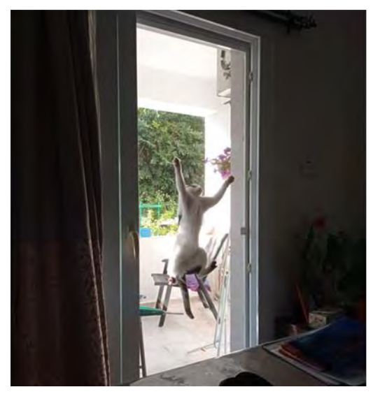
Fig.6 . "Let me in" (P3)

Despite the opportunities mentioned by some of the participants, there were also some teachers who stated their frustrations, reservations, and concerns related to their professional development during the online period. The in-service teacher trainer who took part in this study, for example, reported that s/he also had difficulties, especially during the emergency remote education, because s/he was both the one who was expected to offer support to the teachers and the one who needed help as a teacher. Having been under constant pressure by the administration to do something to help the teachers, s/he conducted a needs-analysis with the teachers to understand what they expected from the PDU during this process, sent questionnaires, held share-care sessions, and had many meetings both with the teachers and the administration. However, s/he said that s/he felt frustrated as what s/he had done was not appreciated by the teachers. The picture s/he shared along with her/his reflections explains how hard s/he tried to "get in" the teachers' professional development territory to support them as a teacher trainer.