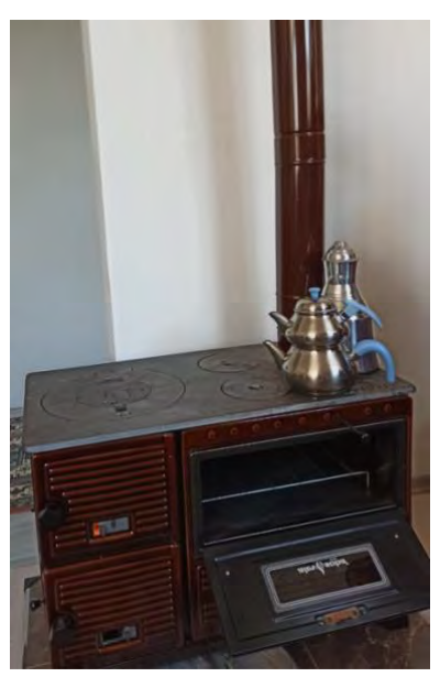
Fig.15. "Chestnut kebab" (P1)

Despite the challenges encountered, the participants pointed out that they learned a lot from their mistakes and managed to adapt to the new normal. One of the participants, for example, mentioned her/his experiences as a course leader giving examples from the exams that didn't work, the questions s/he had to cancel from the exams because of a simple mistake s/he couldn't foresee, or the tools s/he planned to use in the class but didn't work in practice. S/he said all these experiences actually turned into an advantage for the teachers as that is how they got used to being prepared for the unexpected things in the class (P1). To explain this bitter-sweet process, s/he used the picture of the stove as a metaphor and reflected on the issue of online teaching as follows: