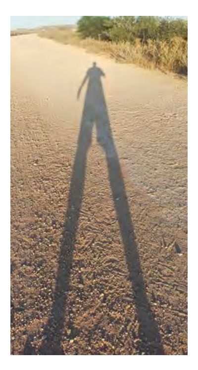
Fig.4. "As the heat declines, the shadow grows" (P5)

"The idea is that when you face challenges, you grow more. We are generally fed by the sun's energy, but when it starts to go down, I mean when things go wrong for us, we actually grow as in the picture. Suddenly, we had to face the challenge of online education, and we had to find new ways of teaching, new ways of testing, and this leads to professional development. This is professional development for me. When everything is alright, we don't feel the need to grow; you need to face some difficulties."