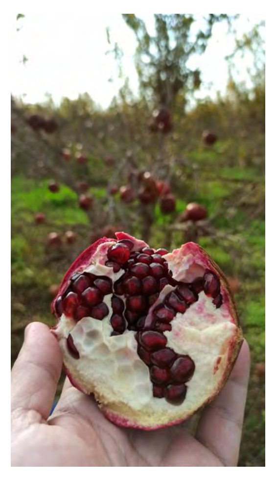
Fig.7. "The Good Red" (P5)

Regarding the academic activities during the online education process, there were both positive views or experiences and the challenges mentioned by the participants. Starting with the opportunities or benefits, one of the participants stated similar ideas with the ones mentioned in the previous theme. S/he said that thanks to online education in the Covid-19 pandemic period, new research areas became available, especially in the field of online education (tools, testing, teaching). Moreover, many universities around the world gave access to their resources for those who want to do research, and lots of online conferences, which the teachers would not have been able to attend under normal circumstances, have been held. Therefore, s/he used the picture of a pomegranate to metaphorically refer to the plenitude of the opportunities offered to the researchers or teachers trying to pursue their academic activities.