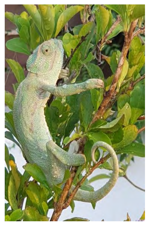
Fig.16. "Pigmented Lives" (P5)

The extract above shows that adaptation to online teaching and using online tools took and required some time, energy, practice, and collaboration, but eventually, teachers managed to survive and even enjoy the whole process despite "still having the pain in their fingers." This view was echoed by another participant who referred to this adaptation process metaphorically using the picture of a chameleon. S/he stated that "teachers are like chameleons in terms of adaptation", and when it comes to online education and using online tools, "It is just a matter of getting used to them". Therefore, what teachers have done in this process was actually "immediately changing their colors when exposed to online tools and don the colors of online education just like the chameleon (P5)."