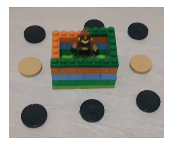
Fig.13. "Trapped in a box with very little connection to our colleagues" (P.7)

"When we were teaching face-to-face at school, we had a very collaborative, communicative and friendly environment. Therefore, going online, gave us the feeling of isolation and loneliness... it never gave the same satisfaction as it used to. This is because at school, it wasn't only about sharing materials or ideas about teaching methods. While communicating about anything, we shared moments where we laughed, got angry or even cried together. Sometimes a friend appeared at the door offering coffee just for me to take a break. I miss everything about being at school. Therefore, lacking these moments never give me the same feeling of collaboration and communication."