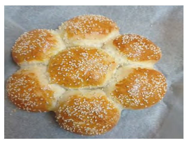
Fig.12. "I didn't think I had it in me!" (P3)

Sharing similar experiences, another participant (P3) expressed what s/he has gone through in this process in relation to collaboration among colleagues through the metaphor of baking bread with no prior experiences. S/he stated that learning new skills during the online education process was like baking bread for her/him because s/he didn't trust her baking skills beforehand, but during the quarantine, s/he managed to do that with the recipes s/he got from her/his friends as s/he felt the need and motivation to bake bread at that time. Similarly, as s/he mentioned, although s/he started online teaching with no experience in the requirements, qualification or knowledge on online education, s/he managed to learn how to navigate herself when teaching online with the guidance coming from colleagues. To express what s/he has gone through in this period, s/he stated: