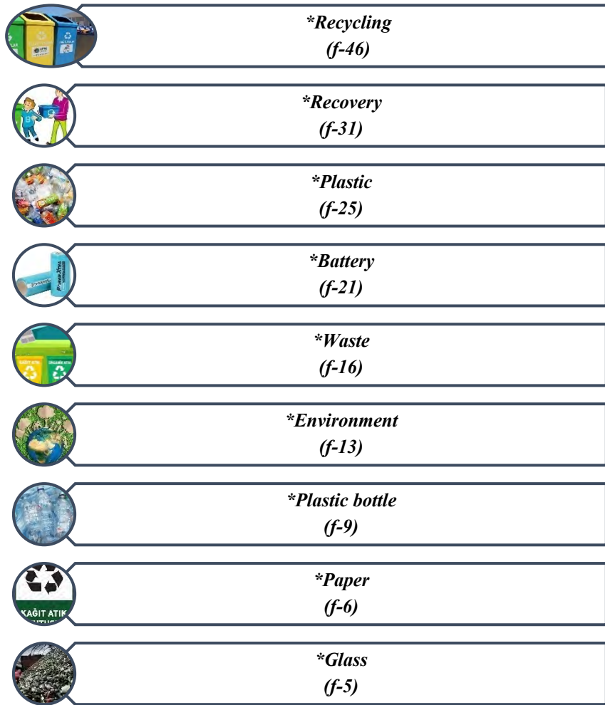
Figure 2: Concepts and frequencies of these concepts employed in the acrostic poetry authored by the study group members

It could be suggested that the fact that pre-service social studies teachers could assign a concrete meaning to recycling and related concepts, which could be considered as the content knowledge competency of the pre-service social studies teachers, was one of the problems encountered in the learning-instruction processes. This was reported by several studies. However, it could not be argued that concretization of these topics in instruction would eliminate all problems associated with recycling. This is due to the fact that the topic or concept was not internalized adequately by the individuals or the society. Thus, the present study employed the views of pre-service social studies teachers via the semi-structured interview form that required qualitative findings that improved the intelligibility of the topic. Furthermore, poems were authored by the pre-service teachers in the study group to contribute to the perceptions of the students and to draw attention to the topic. The analysis of the poems written by the study group members revealed that there was a perceptual diversity about the concept of recycling. This diversity could be considered as a significant criterion in the determination of the awareness level in the study group about the concept of recycling. The examples of the acrostic poetry written by the pre-service social studies teachers in the study group on the themes given in Figure 2 are presented below: