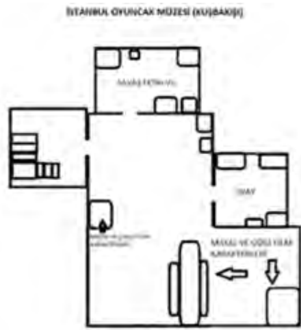
Figure 2. Sketch drawn by the student codenamed Ikranur