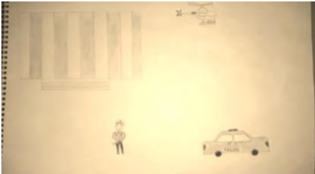
Figure 4. The picture drawn by the student codenamed Ozlem

Drawing on how to protect the museum as a policeman: The student, codenamed Ozlem, stated that she knew the profession of policing more closely thanks to virtual museums. Accordingly, she painted a picture of the reflection of virtual museum visits on her occupational development. The drawing of the student codenamed Ozlem is shown in Figure 4.