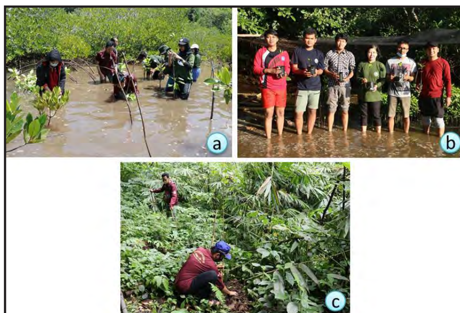
Figure 2 (A-C): (A) Planting mangroves at CMC Tiga Warna Sendang Biru; (B) Mangrove Seedling at Tamban Sendang Biru Beach; (C) Planting Mahogany Trees on Mount Penanggungan

Tests were conducted to measure the variables of environmental care and soft skills. This test is tested at the beginning of the meeting and the end of the environmental geography course. 5 questions were asked about the environmental care attitude, and 5 questions were asked about soft skills. Environmental care attitude and soft skills indicators have a maximum of 100 points. The measurement is divided into five categories: very good (81-100), good (61-80), moderate (41-60), poor (21-40), and very poor (0-20). The test instrument was developed based according to indicators of environmental care attitude by