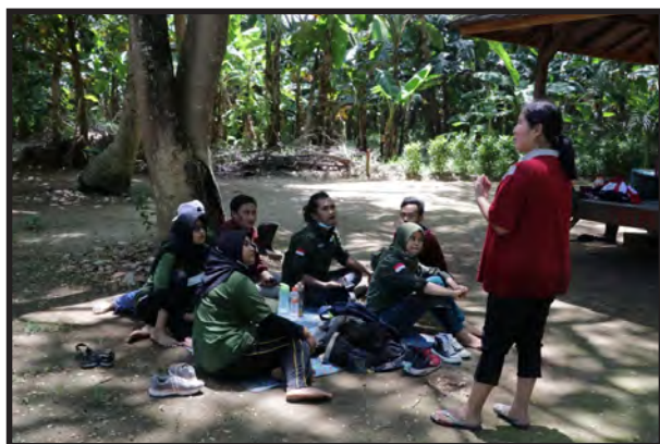
Figure 3: Reflection on the Planting Activities Completed