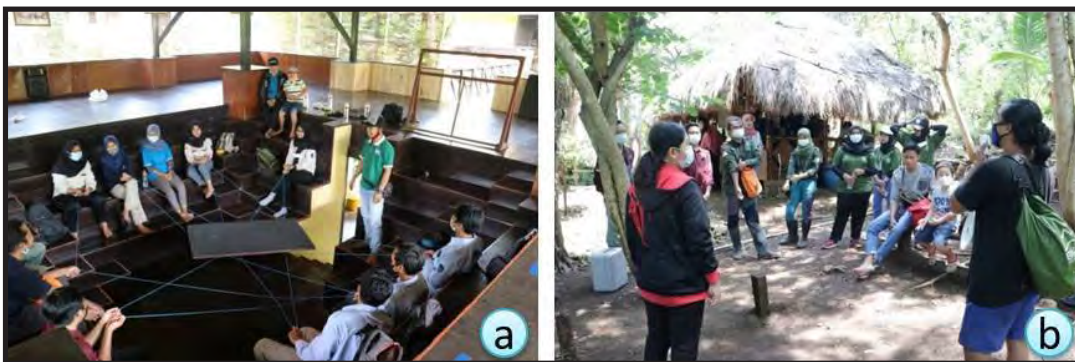
Figure 1: Preparation in CMC Tiga Warna

At this stage, each group of students has designed activities to solve the previously identified problems. The program carried out is planting mangrove seedlings and mahogany trees. This activity is shown in the following Figure 2.