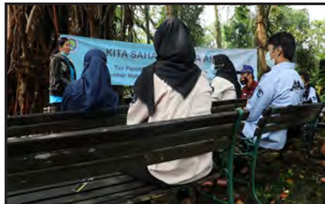
Figure 4. Submitting Reports to Lecturers about implementation and achievement on activity conducted