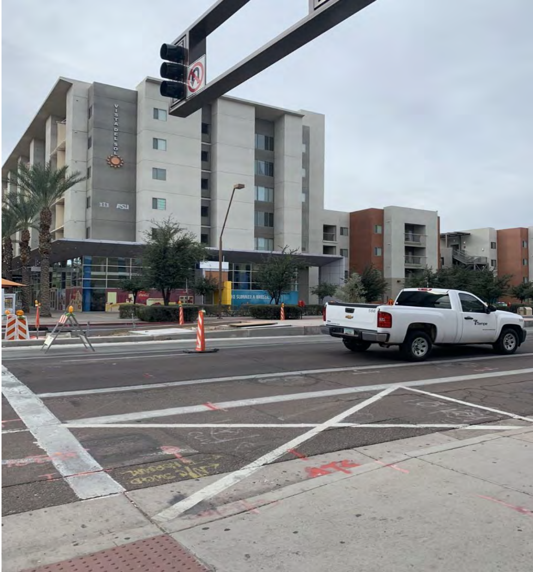
Figure 3. Construction on the Tempe streetcar project outside of the Vista Del Sol apartment complex on the ASU Tempe campus. In the background, the site of the former Walmart on Campus.