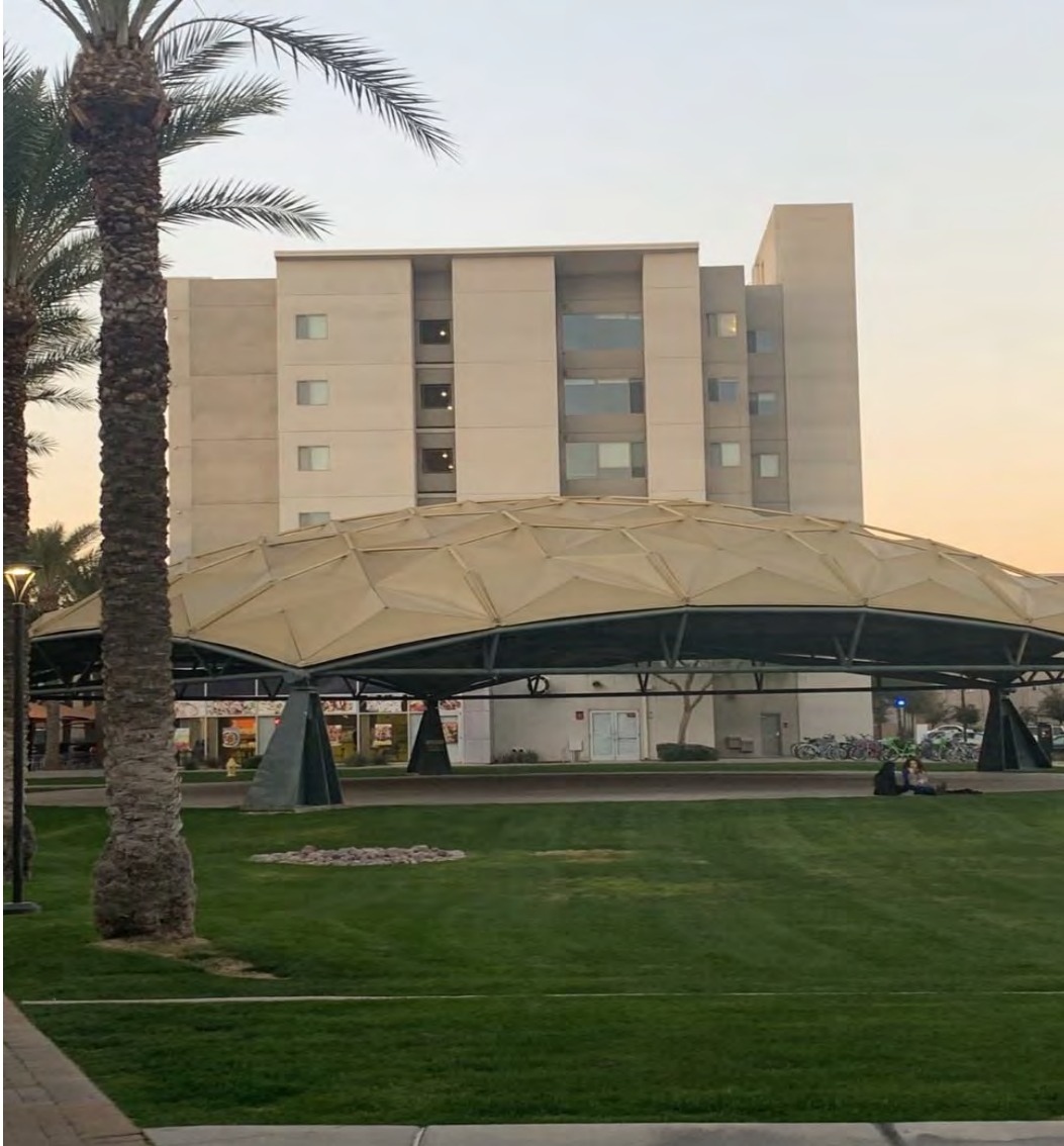
Figure 2. The “Gold Dome” on ASU’s Tempe campus provides community space for students and community members to host events. Borderland’s produce rescue event is held at this space, providing easy access to both ASU students and community members to attend the event.