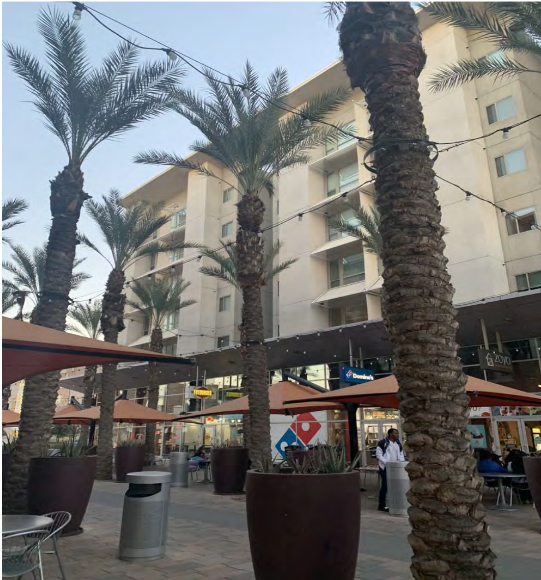
Figure 1. The plaza at the Vista Del Sol apartment complex on ASU Tempe's campus, featuring on-campus dining outlets for students including Domino's, Fatburger, and Zoyo Frozen Yogurt.