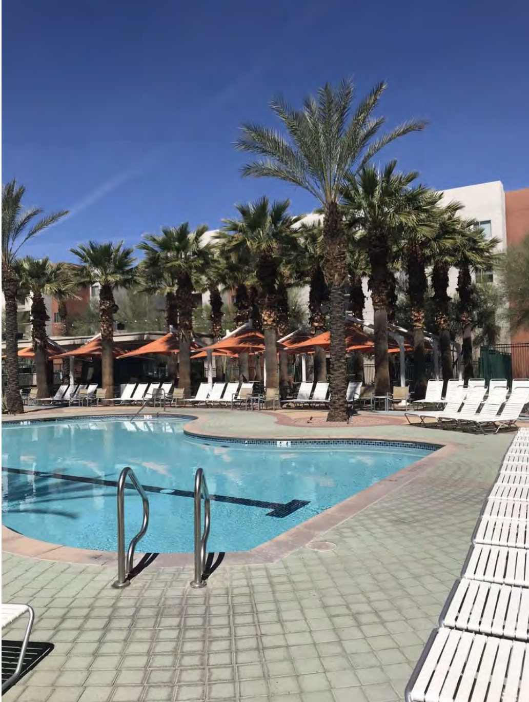
Figure 4. ASU's residence halls feature amenities such as pools and lounge areas for students to use during their free time. These common area spaces are also used by Peer Mentors and other student leaders to host events for residents in the community.