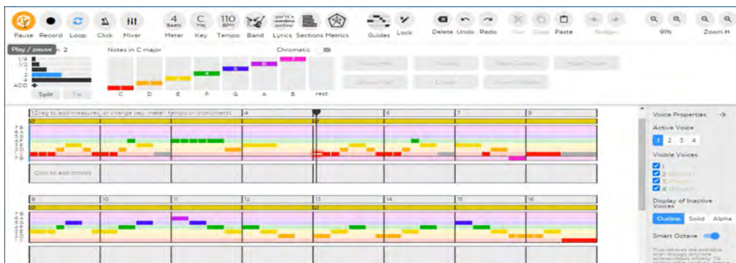
Figure 3: Display of Hookpad Software

In conclusion, based on the results of this study, with reference to the questions posed at the beginning, namely: (1) Can elementary school teachers improve their competence in composing thematic songs? They proved that the majority of them were able to improve their competence in composing songs; (2) Can elementary school teachers use technology in composing thematic songs? They proved that the majority of them were able to use technology to help compose songs; Elementary school teachers indicated that the majority of them were able to use technology to help compose songs; (3) Will a