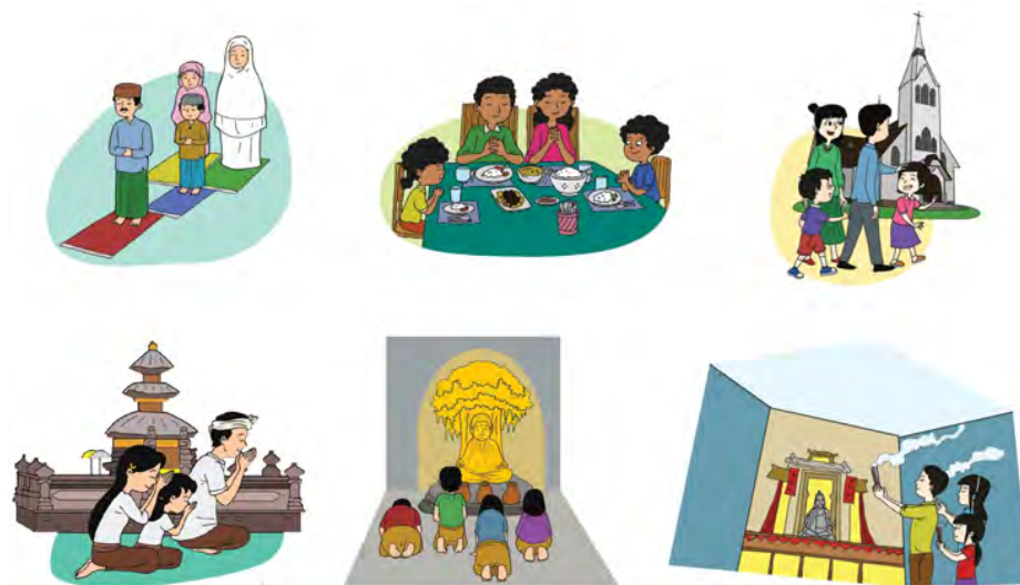
Figure 5 Religious traditions (Textbook Theme 1, p. 14)

Beni: (third student from left, Figure 1) has light skin and straight hair. From Figure 5 (below) bottom-middle picture, it can be seen that there is a boy who has light skin and straight hair is praying in Buddhism liturgy. From Figure 6 number 6 it can be seen that the boy with light skin and straight hair, is participating in Bible reading. Thus, there is unclear information whether Beni is Buddhist or Christian.