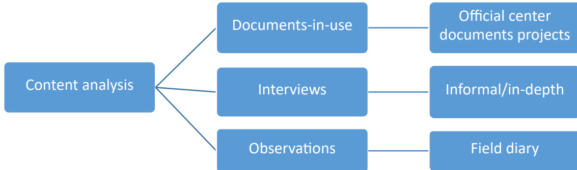
Figure 1. Sources and analysis process.

To analyse the case study in its natural context, we chose the following data collection techniques: school documents, field diary, classroom observations, and interviews. Content analysis is the research technique that has allowed us to analyze the reality of the educational context (Bardin, 2001). Figure 1 details the sources and the analysis process.