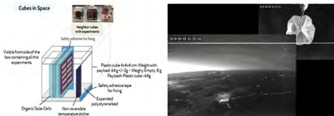
Figure 2. (Left) Cube holder illustration. (Right) The first launch of solar cells attached to an aerostatic balloon that reached an altitude of 37 km, from NASA's Columbia Scientific Balloon Facility in Ft. Sumner, New Mexico through the Cubes in Space Program.

Once the OSCs were created, the students are asked to prepare a scientific poster that includes a search for local applications of solar power devices and the proposal of new applications to contextualize the knowledge acquired during the sessions. The poster sessions are designed in such a way that the students not only have a chance to socialize their findings, while at the same time they get to improve their presentation skills, but they were also designed to ensure that the students appropriate all the concepts learned in the lab by generating ideas that can solve problems in their communities and in the world.