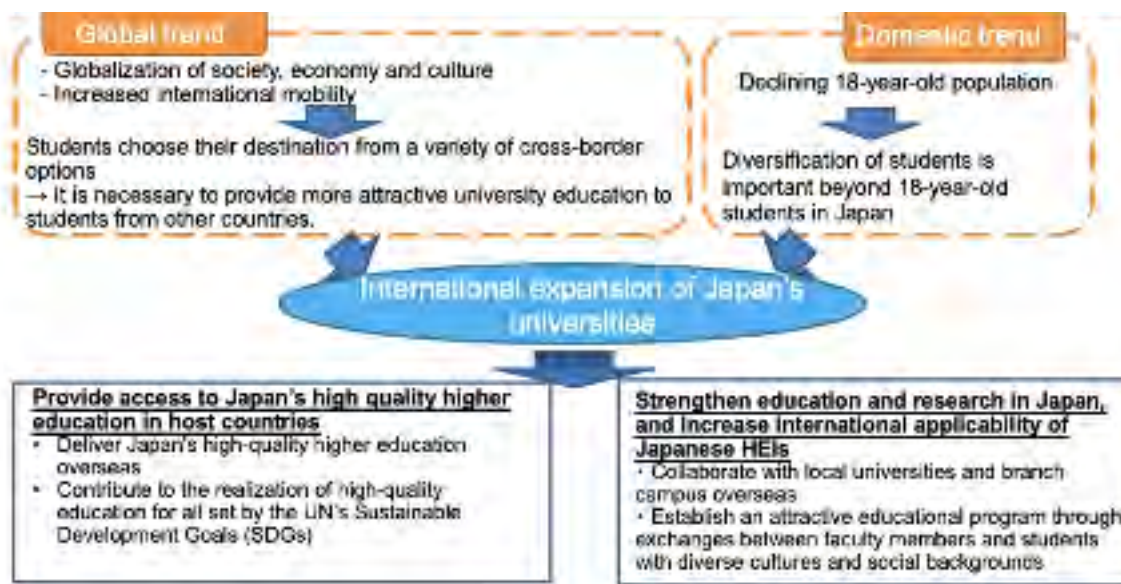
Figure 2 presents the rationales for expanding Japanese higher education overseas, including global trends - such as globalization, increased student mobility, and competition among providers to attract the best students - and the domestic context, including a decrease in the college-age population and the necessity to recruit more students. The guideline proposes that, by offering programs abroad, Japanese higher education would deliver high-quality education in foreign students’ local communities while strengthening the Japanese higher education sector’s global competitiveness.

The Rationale For Japan’s International Expansion Of Higher Education