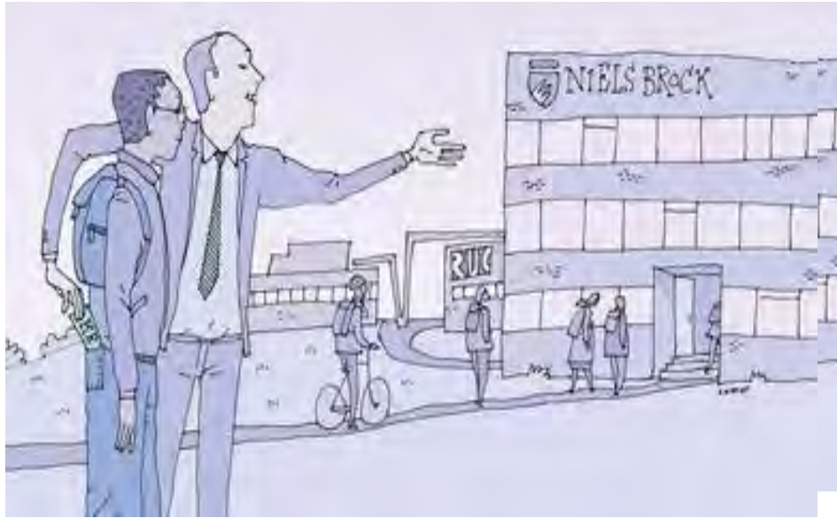
Figure 2: RU paper

One third of international students at RU are Nepalese students who hold at least a Bachelor’s degree from Niels Brock. Nepalese people have most often been appointed by agents who earn a lot of money from providing international students to Niels Brock, an institution which offers non-Danish accredited international education. The students must struggle hard to get an education in the West. We have met, among other things, a Nepalese student and her husband who work full time to scrape money together for the studies. Many others struggle with the special Danish study form at RU and the academic English level. At the same time, poorly paid jobs fill up so much of their time that they have difficulty following their studies (RU Paper is an independent newspaper of Roskilde University).