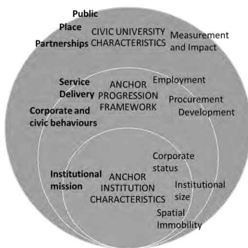
Figure 1: Conceptual framework: UK universities as anchor institutions

The conceptual framework considers how the key characteristics of anchor institutions provide the basis upon which engagement and collaboration can be progressed and what it means for universities as anchors. Figure 1 details these relationships where we consider the concepts as building in specificity from general anchor institution concepts, which apply to all anchor institutions, to how universities can deliver on their promise of becoming truly civic anchor institutions. The concepts in bold are those this project engages with most notably, focusing on the institutional mission of the anchor institution (inner circle); the service delivery and corporate and civic behaviours dimensions of the anchor institution framework (middle circle); and the elements of place, public, and partnership of the ‘civic university’ model (outer circle).