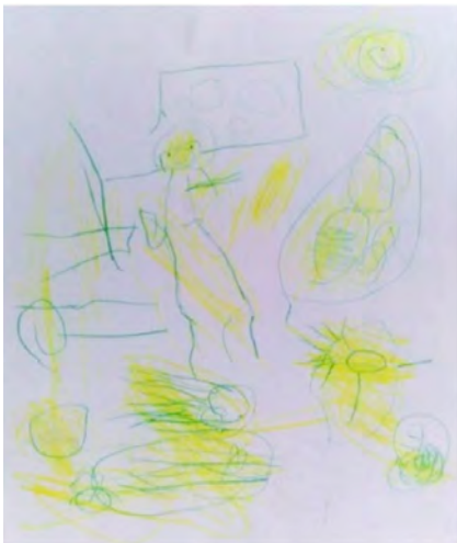
The drawing of A-S35