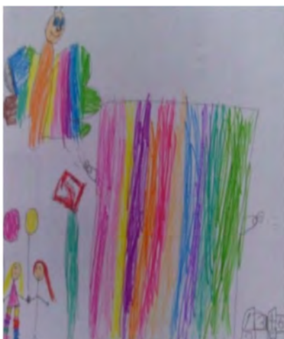
The drawing of B-S48