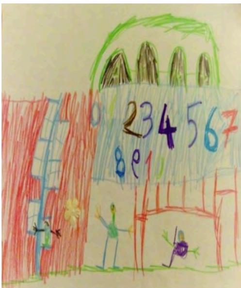
The drawing of C-S9

Some students drew themselves alone without their mouths or noses and drew relatively tall buildings in some drawings as indicators of feeling lonely at school. A few students, two from School A ( f = 5\% ) and two from School B ( f = 3.5\% ), drew these indicators. None of the students' drawings in School C showed signs of feeling lonely. As shown in Figure 10, A-S36 only drew himself without a happy face in his drawings, and similarly, B-S50 drew herself without a happy face next to a relatively high school building. It is worth remarking that in those drawings, students drew themselves without a mouth and nose indicating that they feel both timid and alone at school.