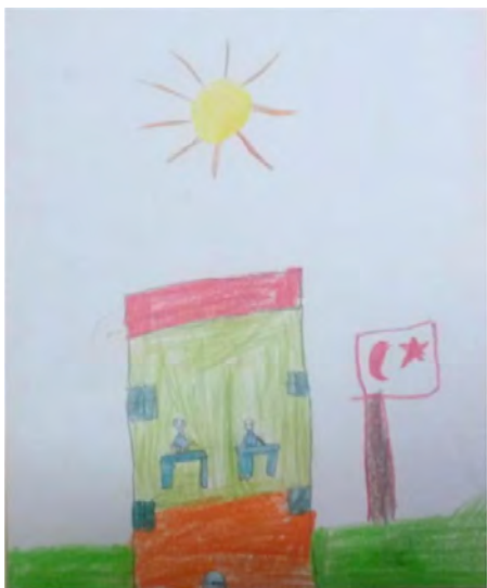
The drawing of A-S40

While relatively few drawings reflected perceptions of school as a learning environment, more students in the interviews described school as an environment for learning new things. Several students from all three schools reported that school was a place for them to learn new things, such as reading, writing, counting, mathematics, important virtues like respect, studying, and doing homework. They also emphasized in the interviews that they liked school as they could learn new things, study, and do homework at school. A-S4, B-S2, and C-S3 reflected their feelings as follows: