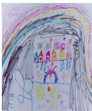
The drawing of C-S13

The drawings in Figure 3 indicate that A-S14 used warm and bright colors, such as pink and green, to represent the school building in addition to including flowers. B-S45 chose his favorite soccer team's colors (red and yellow) to paint the school building and drew smiling, happy students. C-S13 used hearts, flowers, and shapes to decorate their school picture. Although black is used in the picture, it was observed that warm colors were dominant.