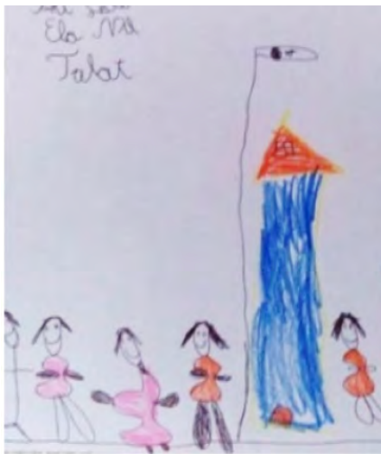
The drawing of B-S35