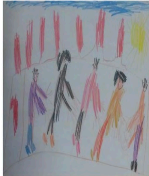
The drawing of C-S16

As Figure 2 illustrates, A-S26 drew herself and her friends playing together with happy faces. She drew one of her friends playing with a ball. B-S48 drew a school building with the schoolyard. She also drew students with balloons in their hands, a hopscotch game, and ringing bells as a representation of break time. C-S16 drew himself playing with his friends in the school. While other students drew themselves playing outside the school building, he painted the playing environment inside the school building.