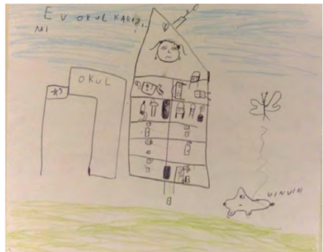
The drawing of C-S1