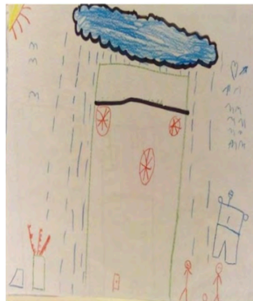
The drawing of A-S20