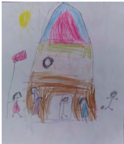
The drawing of A-S26