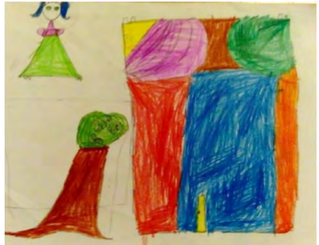
The drawing of B-S50

Finally, the interviews with the students revealed why they felt unhappy at school. Less than half of the students from all three schools expressed that being unsuccessful, being punished, and being exposed to peer violence, and teachers who are angry with students made them unhappy at school.