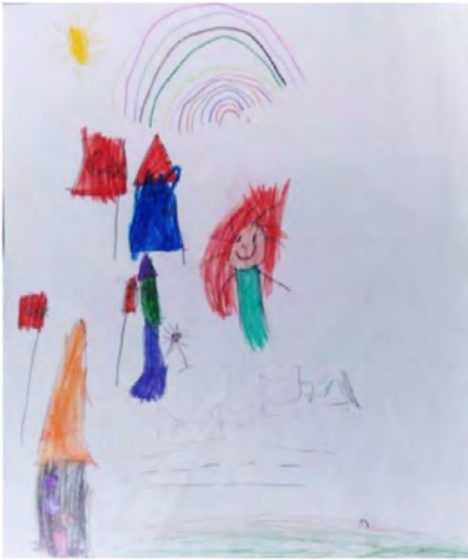
The drawing of A-S17