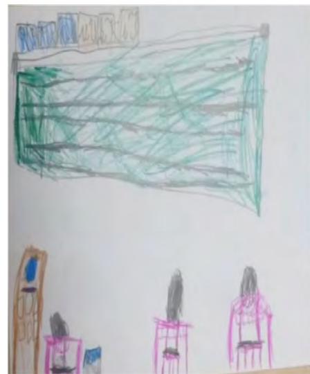
The drawing of C-S6