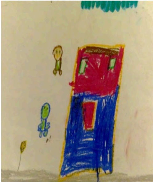
The drawing of B-S27