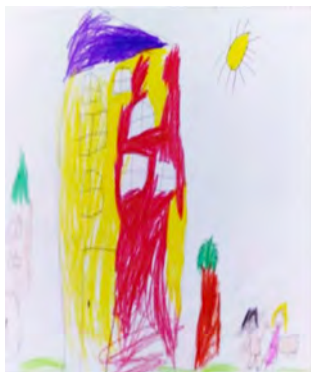
The drawing of B-S45