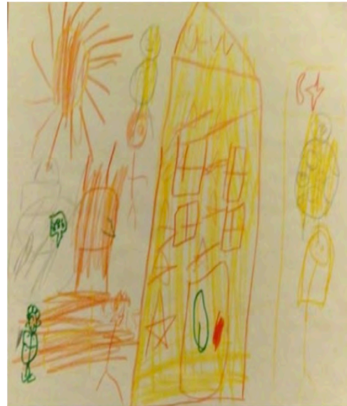
The drawing of C-S2

Rain, students' anxious, shaded faces, figures without eyes, noses, or mouths in the students' drawings also indicated anxiety, sadness, and timidity at school. Five students from School A ( f = 12.5 ), seven students from School B ( f = 12\% ), and two students from School C ( f = 5.5\% ) drew those indicators. For instance, A-S20 drew rain falling on the school, B-S27 drew two children with no nose or mouth near the school, and C-S9 drew children with shaded faces, as illustrated in Figure 9.