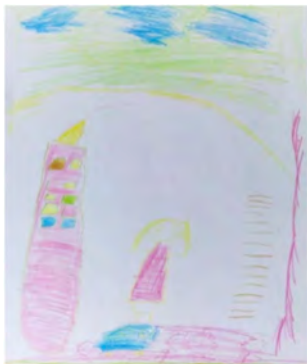
The drawing of A-S14