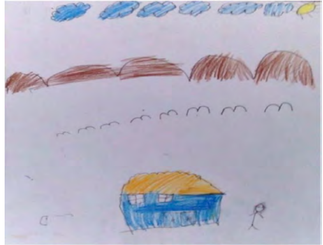
The drawing of A-S36