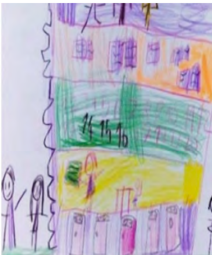
The drawing of C-S18

As shown in Figure 4, A-S17, B-S35, and C-S18 illustrated their teachers larger with smiling faces and arms extended to either side. This may signify that they attach great importance to their teachers, and they consider them valuable in their lives and enjoy a close relationship with their teachers. For instance, A-S17 drew the teacher figure larger than the school building, and B-S35 drew the teacher figure almost the same height as the school building, which may mean either that the teacher is more important for the student than the school itself or that the teacher and school are of equal importance to them. The students also drew their peers with smiling faces and arms extended to both sides, which may signify their close relationships with their peers.