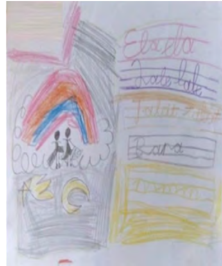
The drawing of B-S51

A comprehensive analysis of the data from students' drawings and interviews showed that several students perceived school as a learning environment. The students drew the classroom environment with desks, boards, letters on the board, and teacher figures teaching students as indicators of school as a learning environment. One student from School A (f = 2.5%), three students from School B (f = 5%), and two students from School C (f = 5.5%) described school as a learning environment and drew accordingly. Although few differences were observed among the number of students drawing the learning environment indicators, more students from schools B and C perceived school as a learning environment. Sample drawings are presented in Figure 7.