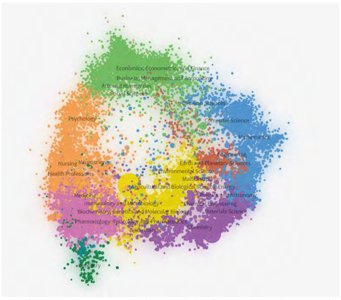
Figure A1: Indexed articles in the Web of Science database by authors in the Global North clustered by subject