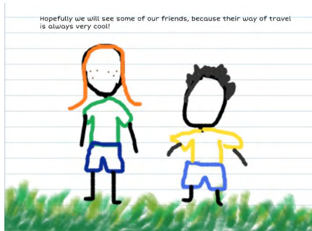
Figure 7: Illustration from Student e-book Our Journey to School

In this modern world where stereotypes rage within the media, it is important that the book underlies the idea of inclusion. The book was created to allow children from all backgrounds to be able to relate to either a character or a theme, furthermore, enhancing a child's self-esteem as it links to one of the three pillars for sustainable development, social equality, as they will feel accepted by society. (Student comment from rationale)