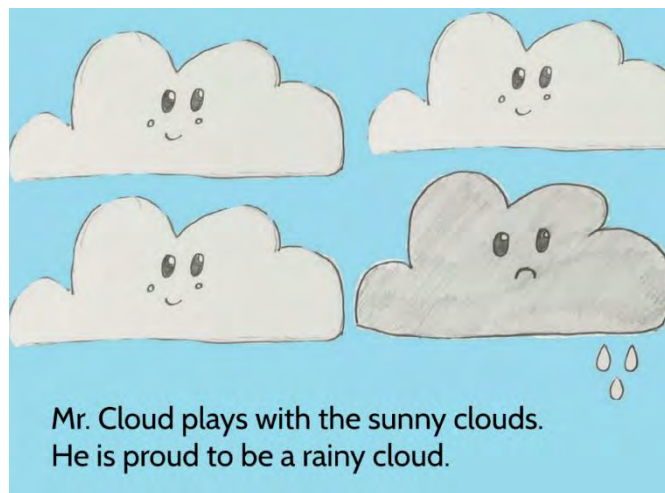
Figure 5: Illustration from Student e-book Mr Cloud