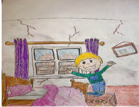
Figure 2: Illustration from Student e-book Maisie's Adventure