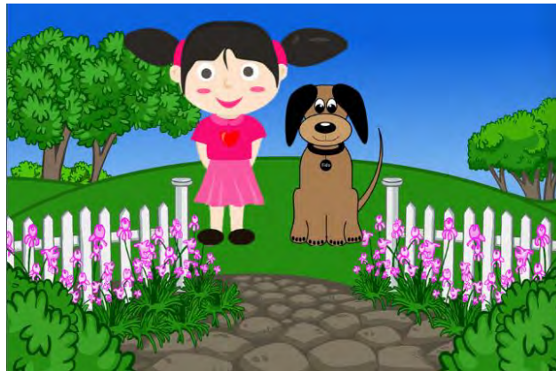
Figure 1: Illustration from Student e-book Fido's First Day Out

As evident from the excerpts above, students particularly celebrated the use of bright colours for children. This was readily witnessed in the e-books, as depicted in Figure 1: