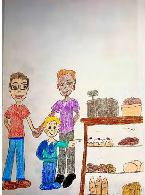
Figure 4: Illustration from Student e-book Maisie's Adventure

The student author of Maisie's Adventure promotes a dialogic view of learning and young children as capable and sophisticated language users, who are able to shape others in the same way they are shaped through dialogue themselves (White, 2017). This suggestion of agency reflects the idea of "children as peers instead of inferiors" (Medress, 2008, p. 23). Much emphasis is placed on dialogue in early childhood education, not least the pedagogy of listening as embedded in the highly regarded Reggio Emilia education approach (Rinaldi, 2006). In addition, the promotion of sustained shared thinking within the UK English Early Years Foundation Stage (English Department for Education (DfE), 2017) is an effective pedagogical strategy to establish intersubjectivity or what Oates and Grayson (2004, p. 56) frame as "a meeting of minds".