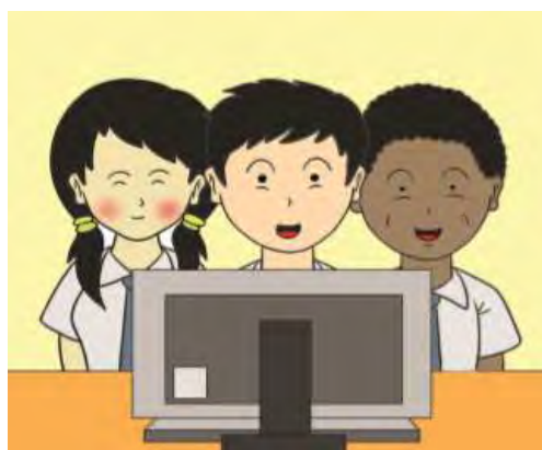
Figure 1. Three students with different physical characteristics

One of the categories in social peace is tolerance of differences. UNESCO in 1996 declare that tolerance is respect and appreciation of the rich variety of world's culture or diversity. The diversity can be as a religions, languages, cultures and ethnicities which can be our treasure. This textbook has provided content and task of tolerance of differences. This category of social peace representation can be analyzed in Fig 1 and 2.