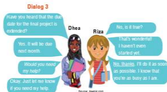
Figure 2. A picture comprising a dialogue between two students who are talking about their process of final project.

Unfortunately, this present study finds the identity of Moslem is more dominant than the other religious in this textbook. It is evidenced in Fig. 3. As seen in first picture (on the left), there is conversation between two students who are talking about Maher Zain. Roy explains to Roni that their favorite singer will be touring next month and they want to go to the concert. Maher Zain is a Muslim Swedish singer who is famous in Indonesia. Some of his songs have also known in Indonesia such as Insha Allah, Muhammad, Ya Nabi Salam Alayka and so on. Another example also shows in next picture (on the right). There are two girls who are talking together. Both girls are wearing hijab (the identity of Moslem). Many Moslem characters can be found in this textbook, but, due to a limitation space, the author just choose the some pictures on the corpus.