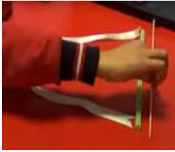
Figure 3. Mert's Comparison of the Lengths of the Ribbon and Pipette