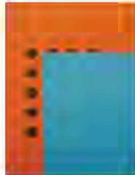
Figure 2. Multiplication and division items for growth point 3.