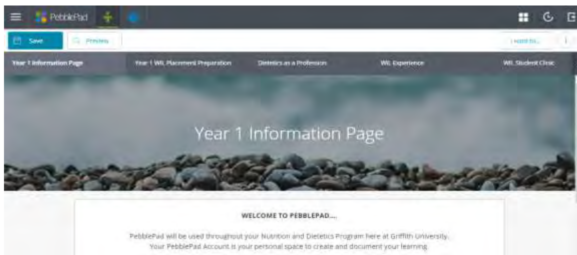
Figure 1: Example of PebblePad within 1 st Year Bachelor of Nutrition and Dietetics

Some existing assessment items were redesigned to utilise the functionality of PebblePad, and some were purpose-developed for PebblePad (Pearson et al., 2018). Constructive alignment was used to improve the courses to optimise student learning, whereby learning outcomes, assessment tasks and learning activities were clearly outlined and linked (Biggs & Tang, 2011). Academic staff provided PebblePad training to each student cohort at the beginning of each teaching period, with ongoing support provided throughout the degree.