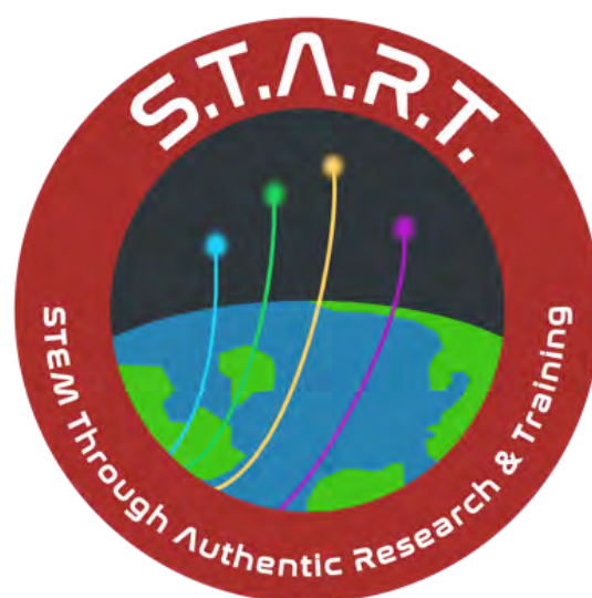
Figure 2. START Mission Patch Logo. In the theme of space missions, the START Program has designed a logo that is printed on stickers, patches, and face masks to provide to students, teachers, and community partners to build a sense of belonging in the program. Future logos will be designed by START Apprentices to further build ownership in the program.