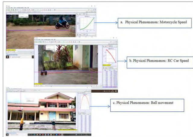
Figure 2. Examples of the mobile experiment activity

phenomenon and recorded in video form by students. Some examples of the MLBL activity are shown in Figure 2.