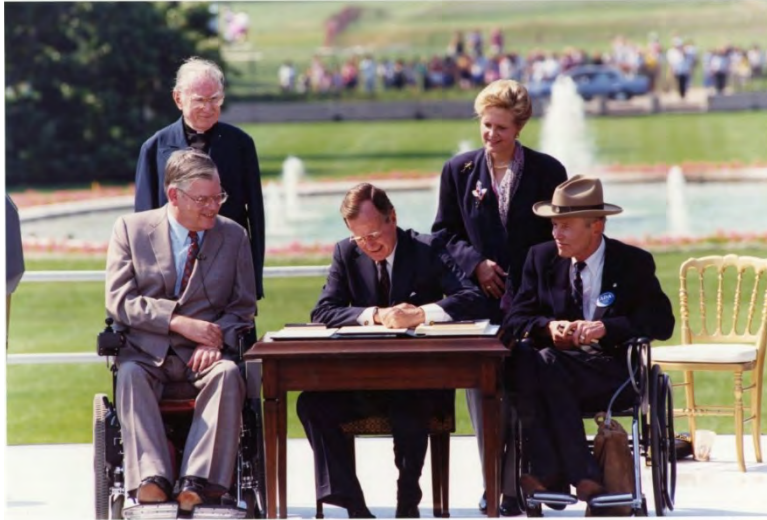
Library and Museum/NARA.