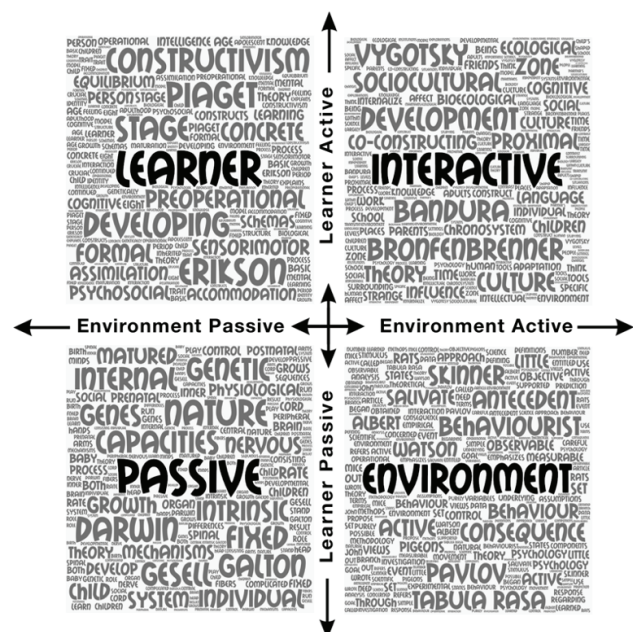
Figure 1. The matrix of perspectives. (Adapted from Bowler, Annan & Mentis, 2007).

the results of a study examining, (a) the alignment of a group of educational professionals' espoused theories of learning with their reported practices, and (b) the perceived usefulness and application of the LTP for practice.