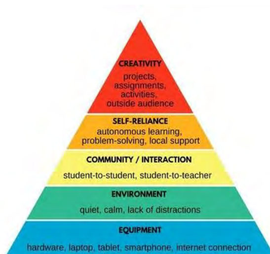
Figure 1: Justin Shewell's Hierarchy of online needs (Shewell, 2020)

The world had to face many changes, one of the biggest ones was the digitalization of education. Justin Shewell has adapted the Maslow's hierarchy of needs to illustrate the essential online learning needs. He analyses and suggests different scales to have an integral online learning starting with equipment, which might seem obvious, however, it has to be highlighted that although the internet connection and the electronic devices are essential to work, not everyone in the pandemic had. Next, the Environment, which refers to the adequate space to learn. The third aspect is Community Interaction, or the community-building activities teachers must plan into their live sessions in order to provide students with opportunities to interact. The fourth need that has to be covered by students to learn is Self-reliance, mainly focused on the encouragement of autonomous learning, along with the appropriate tools, and finally, Creativity, that is a skill that allows students to fulfill their tasks and assignments in ways that connect class projects and work with what they are learning (Shewell, 2020).