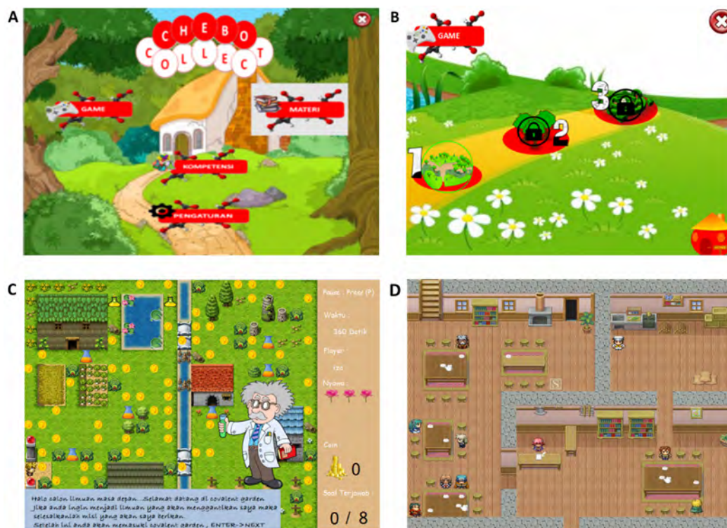
Figure 1. The Chebo collect game design. A. Main menu. B. Level select. C. Level 1, the gardens. D. The player looking for literature in the game

to the challenge in the form of texts, figures, and videos. After completing the challenge, the player's score will be displayed. The teaching materials in the game are covalent bonds, Lewis' Theory, coordination covalent bonds, and polar and non-polar substances (Figure 1).