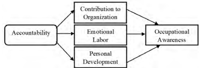
Figure 1: Conceptual framework of the relationships between accountability, dimensions of occupational professionalism (contribution to organization, emotional labor and personal development) and occupational awareness dimension of occupational professionalism

occupational responsibility and self-development are included together in professional learning (Watson and Michael, 2016), accountability enables the improvement of teachers' performance quality (Dizon-Ross, 2018) as an indicator of contributions to their schools. In other words, teachers' being responsible for both school and personal development enables teachers to develop their occupational awareness and thus occupational performance. The conceptual framework created based on the described theoretical foundation is presented in Figure 1.