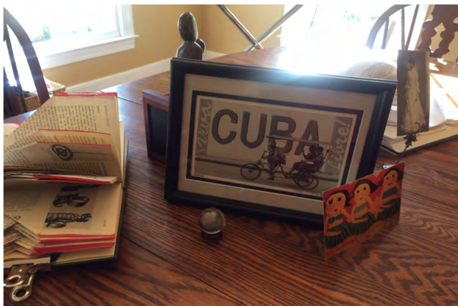
Figure 1. Examples of Still Life Photographs

To prepare, the instructor creates a still life scene as described above; then, the instructor takes a set of photographs of the scene in a 360-degree fashion. Each photo represents a sliced view of the still life, mimicking the face-to-face individual views. See Figure 1 for example photographs from Phillips; these are four of eleven total photos in the set, roughly representing the still life at 90-degree angles.