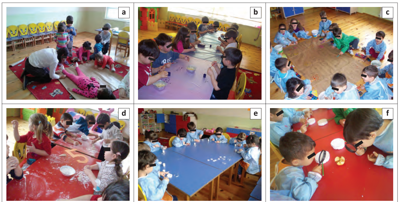
FIGURE 1: Some sections from the kneading and paper or collage works of the modular art education programme applied to children.

The data collected from the control and experimental groups were analysed using SPSS 15. As the data were normally distributed, parametric tests, the independent samples t -test, the Kruskal–Wallis test and one-way analysis of variance were performed. Frequencies and percentages were also interpreted.