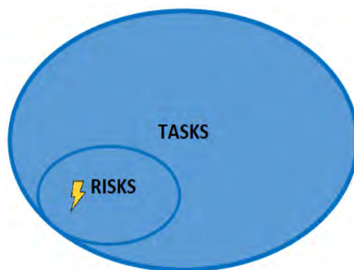
Risks as a Subcategory of Tasks

We believe this conception brings a certain new dimension to TBLT or at least addresses possible gaps in previous thinking and practice. As Ellis et al. (2020) point out, TBLT's focus "has been primarily on the cognitive dimension of learning" (p. 172), even though it is also compatible with experiential learning. In this sense, the notion of risk can add value to the TBLT field by highlighting tasks with experiential and emotional aspects. Defining risks as a special category of tasks raises questions related to individual learner variables. As indicated earlier, risks are dynamic. What some learners perceive as a risk would be perceived as just a task by others. In this sense, it becomes difficult to define a priori which tasks fall within the subcategory of risks indicated in Figure 2. It is precisely for this reason that the operationalization of risks in the Linguistic Risk-Taking Passport is learner-driven. The passport explains to learners the concept of risk and asks them to choose what constitutes risk for them from an extensive list of items, and to engage in