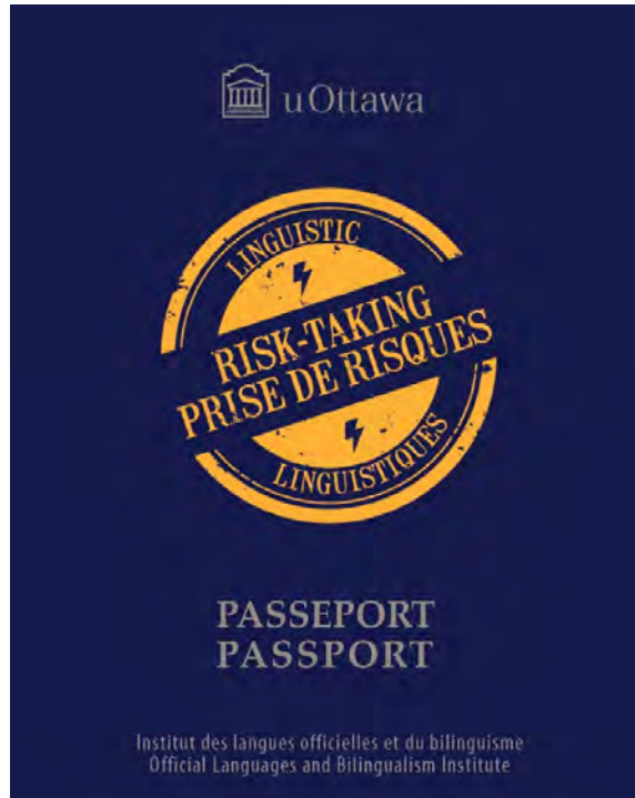
Sample Risk-Taking Pages from the English Version of the Linguistic Risk-Taking Passport