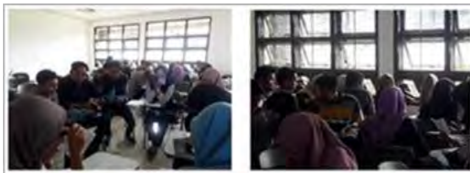
Figure 1. Student Activities in the implementation of Cooperative Learning (Our Documentary; 2019).

Lecturers assigned five Kaba titles to be read by students together in five working groups. Everyone in the working group must have the same material. The readings done together in the working groups became the material for writing the play. Each student in their working group must read critically and imaginatively their assigned Kaba story. There are five Kaba divided across five groups of students. The title of the five Kaba are: Rambun Pamenan , Puti Nilam Cayo , Rancak di Labuah , Siti Baheram , and Siti Kalasun . The activity of reading and writing plays carried out in the classroom uses collaborative learning methods. Using this method means each student must actively read and discuss with other group members the Kaba . Figure 1 shows photographs of students in the sample group who seem enthusiastic about using collaborative learning methods in their drama classes.