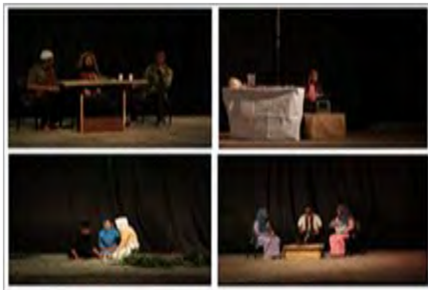
Figure 2. Student Assessment Activities in Drama Classes (Our Documentary: 2019).

The jury assessment does not affect the perception of lecturers in making assessments for each student in the class. Lecturer assessment aims to assess all of the students' activities. Meanwhile, the jury's assessment aims to appreciate the interests and responses of students learning local culture through drama classes. This researcher's preference is for achieving the planned impact of the drama class learning process. The following four photos are evidence of staging activities for the performance assessment of drama class students.