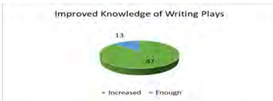
Figure 4. Improved Knowledge of Writing Plays

Second, based on a questionnaire survey, students replied that they increased their knowledge and skills in drama writing after taking drama classes. Students also reported an increase in knowledge from learning local culture. Student improvement in writing plays is shown in Figure 4 below.