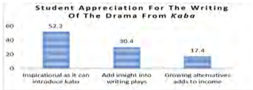
Figure 5. Student Appreciation for the Writing of the Drama from Kaba

Third, online questionnaire surveys also collected data on students' knowledge about local culture, especially Kaba . The findings of the data in Figure 5 below explain the level of student appreciation for the Kaba .