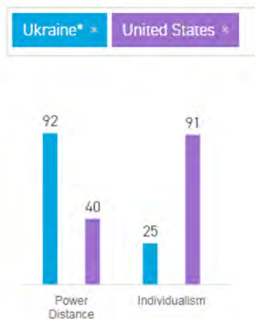
Figure 1. Individualism/collectivism and distance of power in the USA and Ukraine

The team learning practice was heartily welcomed by foreign institutions but encountered unexpected difficulties: although inspired by the idea of teamwork and collaboration, the students could not self-organise to work effectively in a team (Duncan, 2013; Mayer and Bello, 2012). To ensure due attention to the cross-cultural differences we compared American and Ukrainian business cultures by two cultural dimensions most essential for the teamwork – individualism/collectivism and distance of power, which differ considerably between the USA and Ukraine (fig. 1) (Hofstede et al., 2005; Hofstede Insights, Belyh, 2019; Borysenko, 2017).