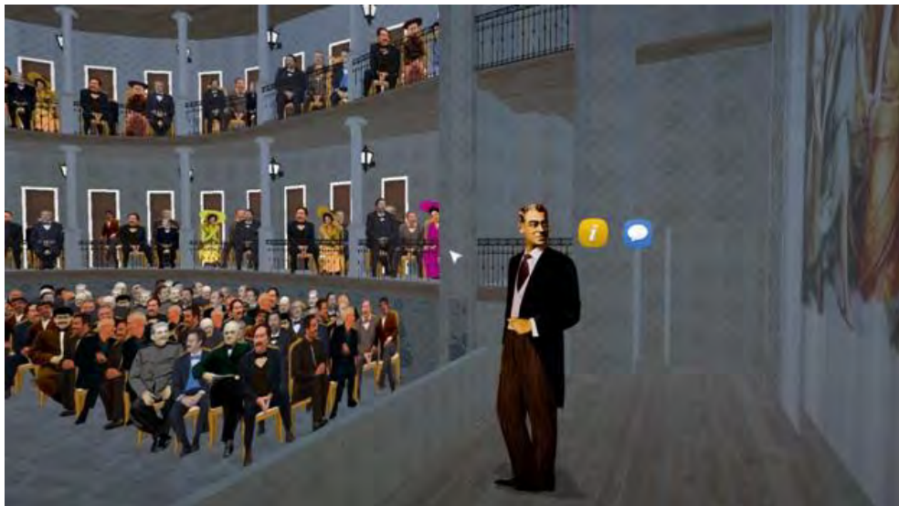
Screenshot 2: Virtual Museum, São João da Bahia Theater, screenshot, internal ambience.

Therefore, when opening this first application, for analysis and authentication of the Virtual Museum São João da Bahia Theater already modeled (Screenshot 1 & 2).