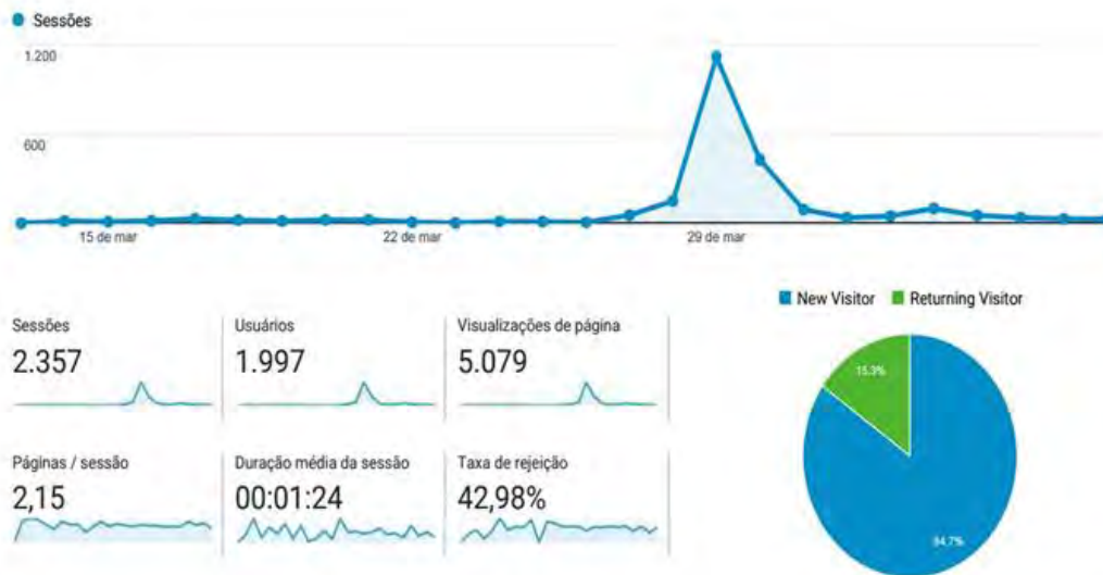
Figure 2: Overview, period from March 13 to April 7, 2017. (1st application, 3rd cycle)

how the interactions in the 1st cycle, 1st application, and subsequent authentication (Figure 2).