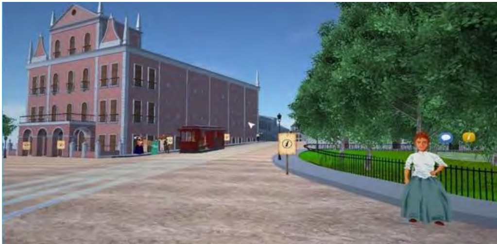
Screenshot 1: Virtual Museum, São João da Bahia Theater, screenshot, external environment.

(free program in which the user is allowed to register and mark their data through possible tools available in their environment), which, in turn, generated the graphs that gave us parameters for analysis from the visits and interactions of the subjects and internauts to the São João da Bahia virtual museum,