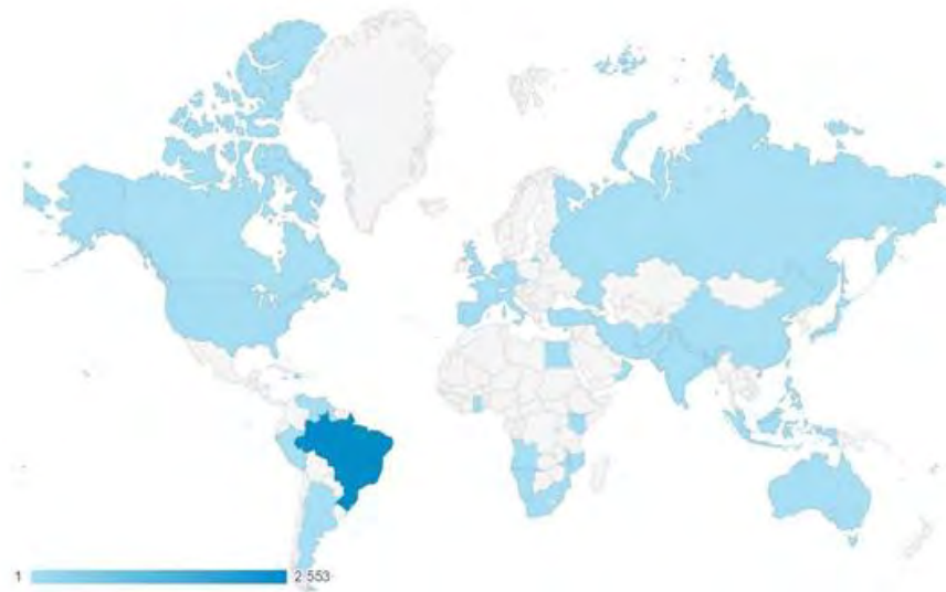
Figure 4: The Virtual Museum around the world

inside the Museum; responses of the characters as devolutive to the interacting subjects; a more practical solution to the plug and play issue; to place all the dialogues of the Virtual Museum (texts) in a second language, preferably in the English language, so that there is a greater interaction and interactivity on the part of the internauts around the world; a better resolution of answers so that operating systems can "run" the Virtual Museum, São João da Bahia Theater, by at least 90%, punctuating the mishaps that discouraged Internet users from downloading and navigating the Museum; the impossibility, at this moment, of the subjects and users to be able to see the course and to create collaborations from the interactions and interactivities within the Virtual Museum itself, that is, a more dynamic collaboration system; and so many other details that could be listed here in this closing analysis.