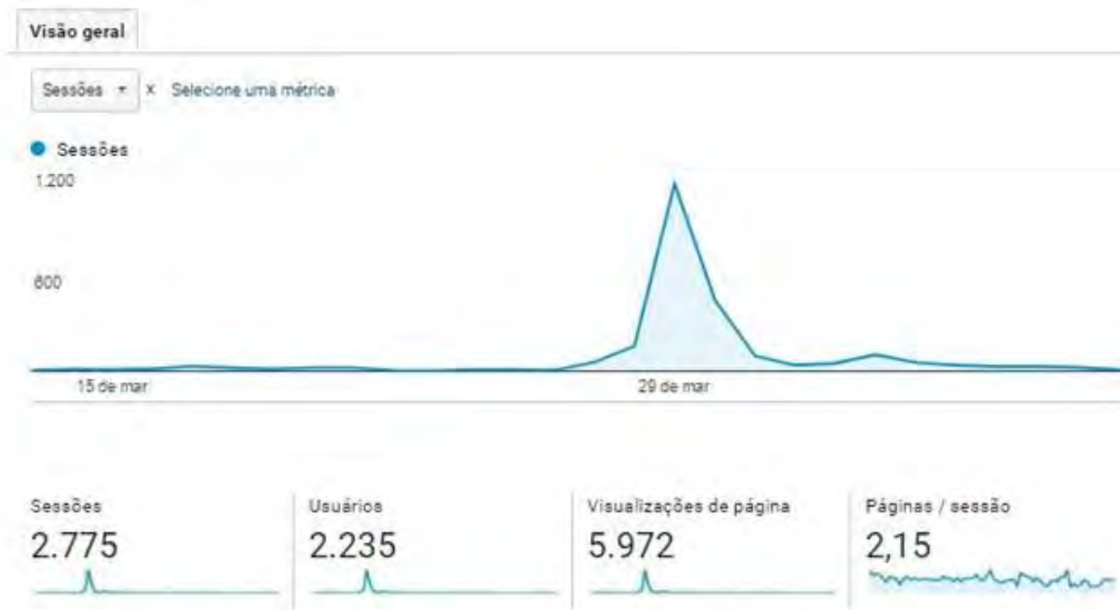
Figure 3: Overview, period from March 13 to May 12, 2017. (Overview all cycles, application)

partnerships of the 1st and 2nd applications, since we work with practical solutions and cycles (processes) in which we will always be giving feedback. So, for the 3rd cycle, 3rd application, which, for reasons of didactics and science, has not been deepened here in its analyzes, we already have the access of 340 users, with 975 page views, 296 in Brazil and 628 outside it (Figure 3).