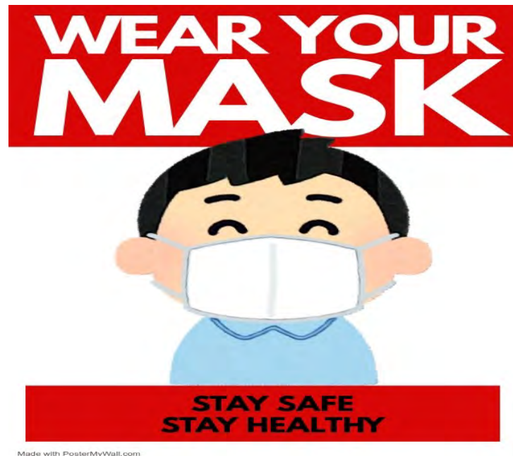
Figure 2. A sample poster

You need to wear your mask whenever you leave your house. The mask must cover your nose and mouth so that it can protect you from the COVID-19 virus, especially when you are in a public place and meet a lot of people. Always remember to wear your mask, stay healthy, and stay safe!