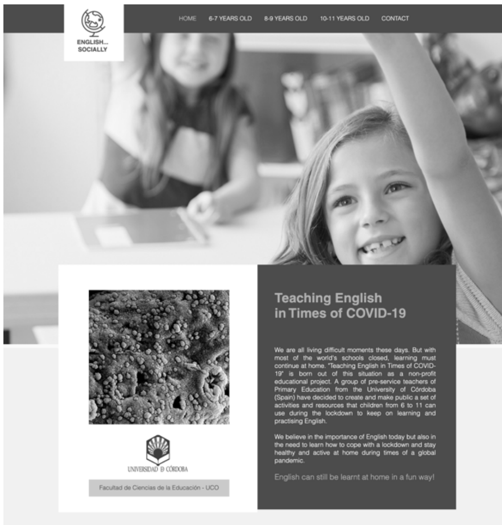
Figure 1. Online repository “Teaching English in Times of COVID-19”