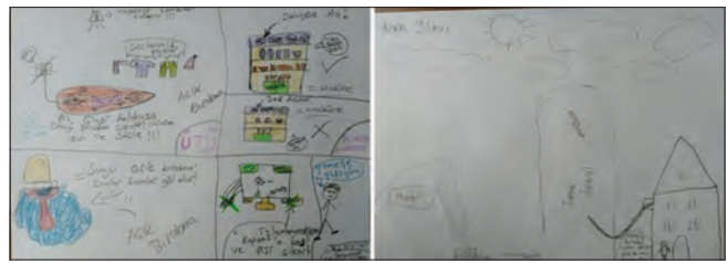
Figure 2: The drawings by S6 and S12

S13 “There are too many cars, too much fuel is used, the lights are always on in the houses. There is global warming, living beings die.”