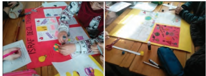
Figure 3: The drawings by S12 and S19