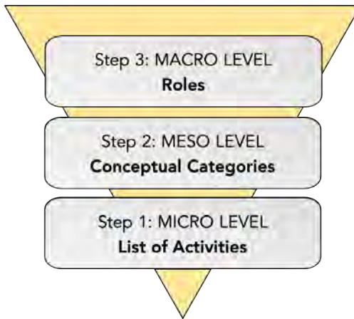
Figure 1. Three-Step Coding Process.

In Step 1 (Micro Level), the researcher applied process coding (Saldaña, 2016) to generate a descriptive list of activities performed during remote learning. At this step, significant quotations were noted. In Step 2 (Meso Level), the researcher applied concept coding to make groups of lists of activities that fit into broader conceptual categories (Saldaña, 2016). Concept coding is a method by which the researcher “transcends the local and particular of a study to more abstract and generalizable contexts,” harmonizing data into larger concepts (Saldaña, 2016, p. 120). In Step 3 (Macro Level), the researcher aligned the categories and parent engagement roles guided by but not limited to those described in the ACE framework.