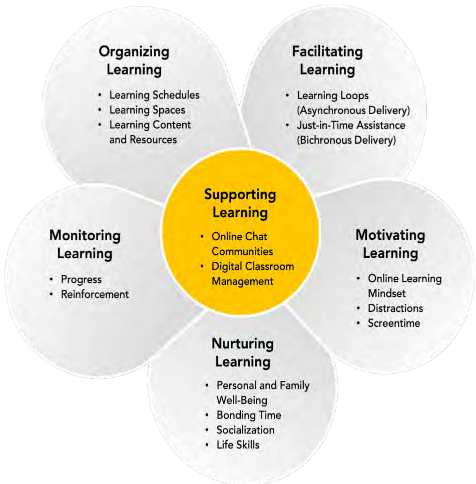
Figure 2. Parental Engagement Roles and Activities During Remote Learning.