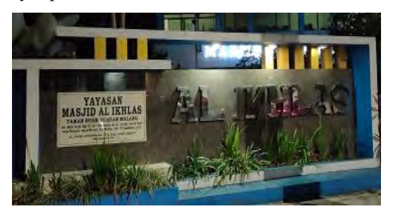
Figure 2. Al Ikhlas mosque sign

Some worship places attach the name of the institution or foundation. This gives information that the place of worship is owned by a particular institution or foundation.