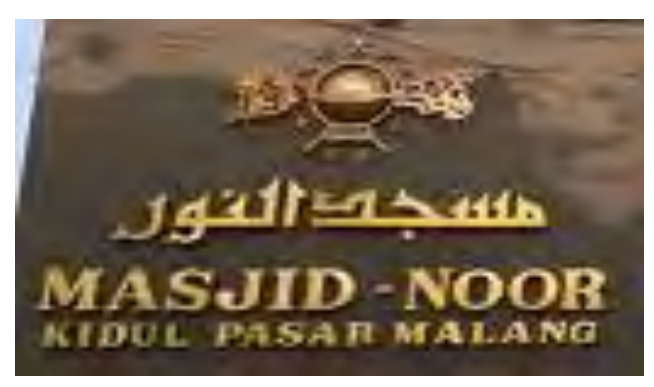
Figure 11. Multilingual Arabic, Bahasa Indonesia, and Javanese

Javanese is no longer considered an ancient language. Javanese is able to enter into the joints of modernity which substitutes the role of Arabic. Cahyaningati (light in the hearth) is the name of a mosque with modern architecture (see picture). Cahyaningati is a substitution phrase from An-Nur (light) where the second name is more popularly used in mosques in general. This substitution step with modern architecture is a symbol where locality is able to 'call' modernity. Local people who are predominantly ethnic Javanese are becoming increasingly aware that Javanese can take part in the arena of modernity.