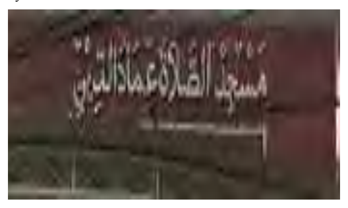
Figure 12. Mosque with Arabic script

From table 11, Arabic (script and/or lexicon) is involved in 79 data (87.8%). This situation indicates that Arabic has become an important language in conveying religious messages. Islamic symbols, such as monotheism, holy verses of the Koran, Islamic figures, and Islamic expressions, are played in educating and instilling the love of worshipers towards their religion. Although Arabic is studied and used in a limited domain (madrasas, Islamic boarding schools, Islamic universities), this does not rule out the use of Arabic and its script in massive communication in society. With the majority of Muslims, the use of Arabic is not only considered to understand its meaning, but rather the strengthening of Islamic symbols.