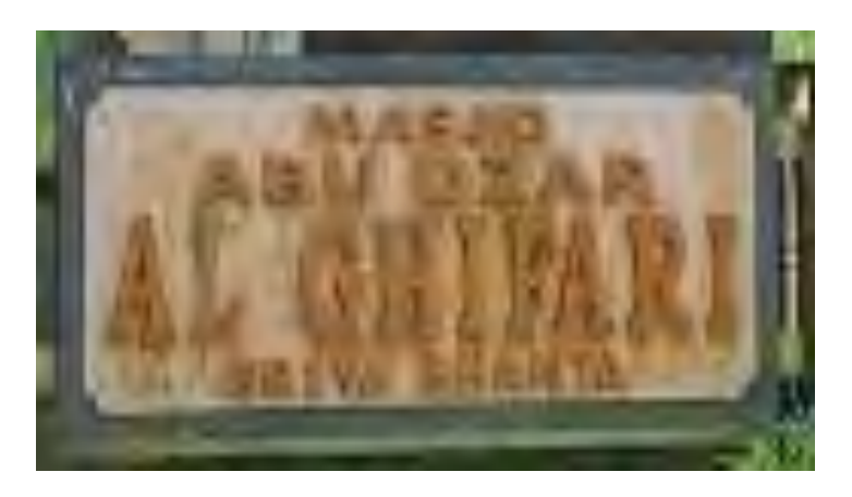
Figure 5. promotion through religion

Places of worship can also be a promotional medium. Promotion through religion is a more effective promotion model. The promotion has the aim of disseminating information about a product to potential customers, getting new customers, increasing sales and profits, differentiating and favoring products compared to competitors, shaping product images, and changing consumer behavior and opinions about the product.