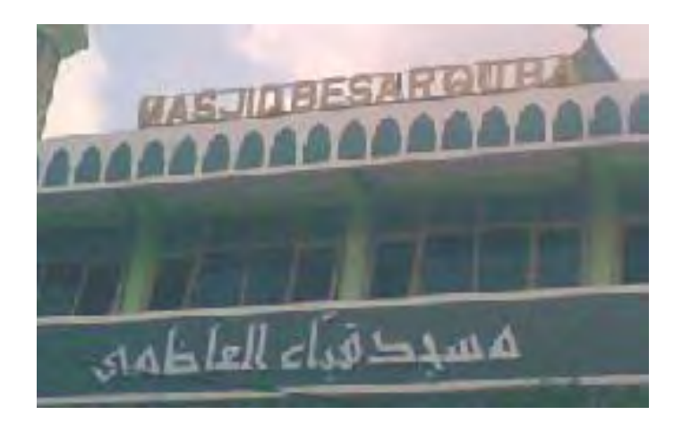
Figure 1. The mosque name which replicates the Quba Mosque name in Medina

From the survey, researchers found six types of information. This information appears in signs on the signboard of places of worship, namely (1) identity (2) owner (3) Islamic sector organization, (4) warning, (5) promotion, (6) location marker/address. The names of places of worship were taken from the surah in the Koran, Muslim leaders, heroes, and Islamic quotes. There is a mosque name that resembles the name of a mosque in the City of Medina, Saudi Arabia.