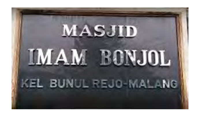
Figure 6. Street name use as mosque name

Figure 6 is an example of the location marker where Imam Bonjol Mosque is located on Jalan Imam Bonjol Malang. With the vast area of Jalan Imam Bonjol, Imam Bonjol Mosque can be a location marker. For example, when someone asks about a place in the Imam Bonjol Street area, information can be given by referring to the area near the Imam Bonjol Mosque (if the area is close to the mosque).