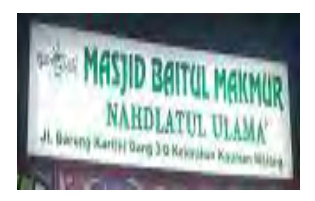
Figure 3. The name of a mosque with the Islamic organization

Christianity in Indonesia has sects, namely Lutheran (Lutherans), Kharismatik (Charismatics), Injili (Evangelicals), and Bala Keselamatan (Salvation). The religion of Islam in Indonesia, especially in Java, also developed Islamic organizations, namely Nahdlatul Ulama and Muhammadiyah. Islamic organizations certainly influence people's perceptions. The information displayed in the sign will support the perception of the community to decide whether to become worshipers or not.