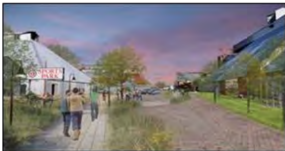
Figure 2. High Cotton character sketch developed from the Lake Flato Architects design Charrette from Graduate Studio 2 (Gus Starkey and Urban Tech with assistance from Lake Flato Architects).

Through discussion and debate, the High Cotton team drew on community input and conceptually organized the homeless facilities on the north site using a series of sketches and plans, like the one shown in Figure 2.