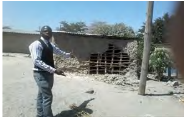
Figure 1. A Dwelling Structure Found in One of the Informal Settlements

The data which is presented below came as a result of using the observation instrument. The researchers moved around the area where the informal settlements are located. This data from observation is presented below. In Figure 1, a structure of an informal settlement facility is shown.