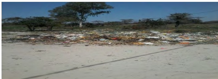
Figure 2. A Dumping Site in an Informal Settlement

The dumping site shown above is close to dwellings. This is evident from the fact that at the background, some dwellings are observed under the tree and beyond. However, these dwellings are so close to the dumping site. It has been pointed out in the literature that these residents do not have proper sanitary system. Figure 3 below shows a structure used for bathing purposes and also for helping one, when nature calls.