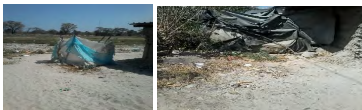
Figure 3. Structure for Bathing in One Informal Settlement

The dumping site shown above is close to dwellings. This is evident from the fact that at the background, some dwellings are observed under the tree and beyond. However, these dwellings are so close to the dumping site. It has been pointed out in the literature that these residents do not have proper sanitary system. Figure 3 below shows a structure used for bathing purposes and also for helping one, when nature calls.