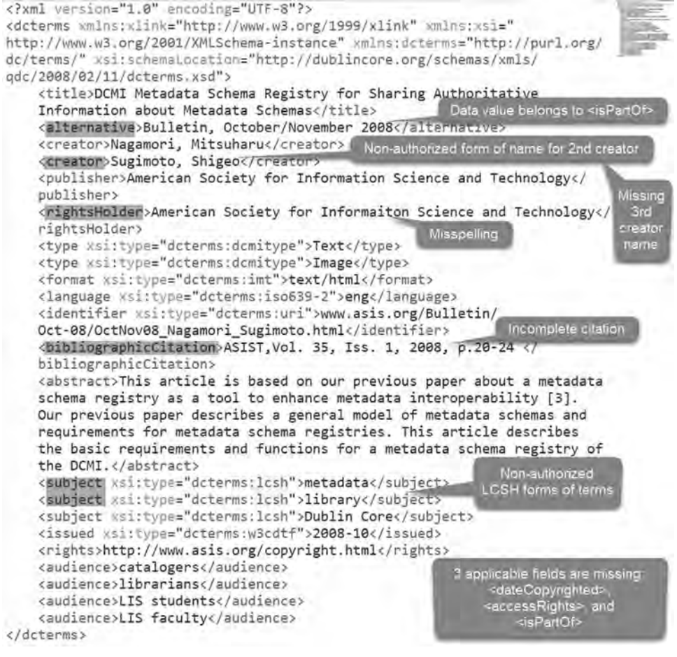
Figure 1: Example of a student-created metadata record showing metadata quality issues

Table 1: Number of fields with metadata quality issues per student-created record (n = 73)