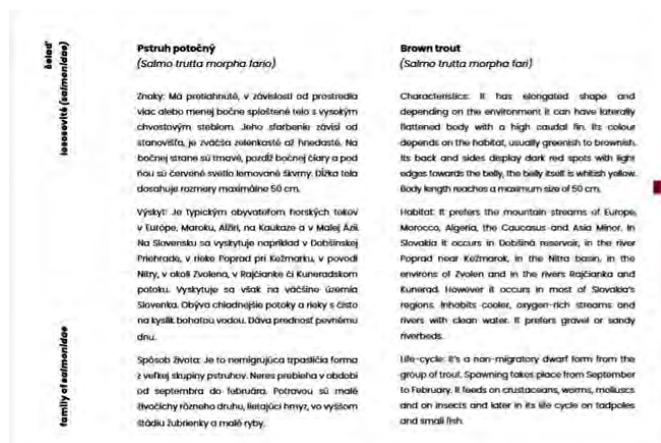
Fig. 2. Leporelo