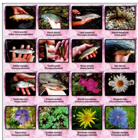
Fig. 3. Memory game

The images of the created memory game (Figure 3) contain photographs of selected species of fauna and flora of the local landscape. The teacher can use this method of teaching at the beginning of the lesson in the motivational phase. The memory game contains 32 pairs of pictures. The teacher can divide the memory game into several parts in advance and also divide the students into several groups so that the other phases of the lesson can be completed in time. The pictures contain both Slovak and Latin names of the species. As part of the use of memory game in primary school, the education of Latin names is not required. For high school students, respectively can require some Latin names after considering the teacher.