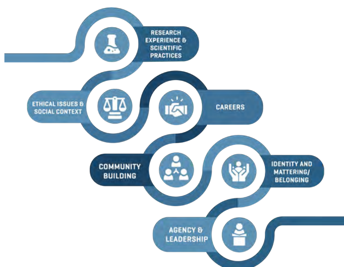
Figure 1. Program Design Overview.

building, identity/belonging, and leadership/agency. These areas, which are summarized in Figure 1, Program Design Overview, are discussed in more detail below. For a detailed schedule of weekly activities mapped to these pillars, see Appendix B.