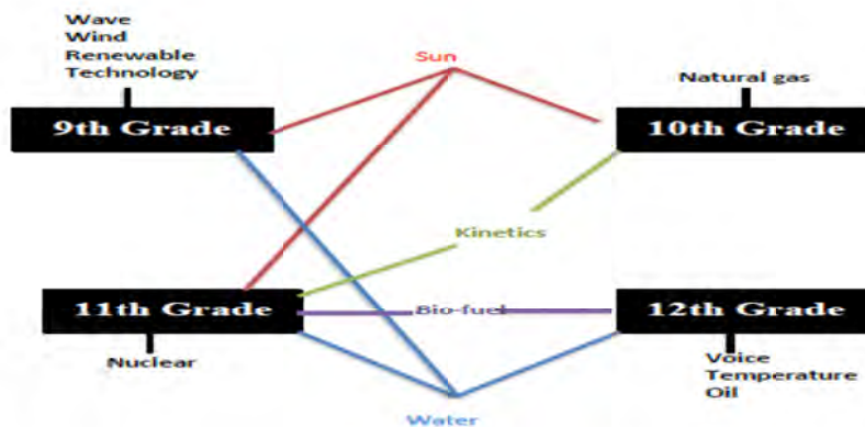
Figure 2. Concept network designed for cut-off points between 10-14

Considering at all grade levels, the words that have frequency of 15 at least, therefore given at the cut-off point as 15 and above suggest that students relate the concept of energy mainly to energy sources, which are oil, coal, fossil fuel, electricity, natural gas, edible, mechanical, thermal, nuclear and kinetics. Especially, the existence of more scientific words among the 12 th grades such as mechanics , kinetics and potential can be interpreted as differences in the developmental process of classes.