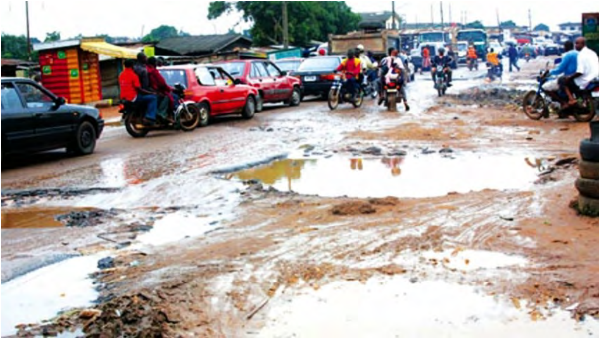
Figure 2: Unmotorable Road, Commonly Sighted in Many University Host Communities in Nigeria