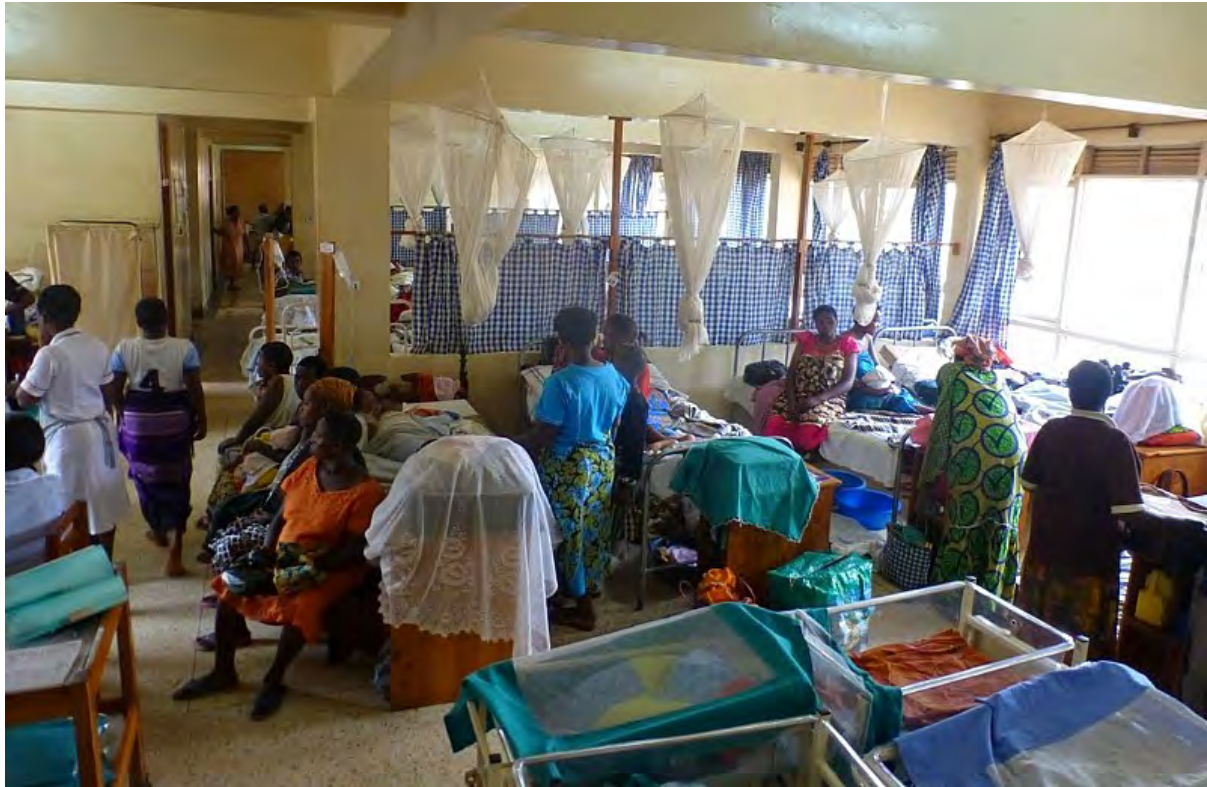
Figure 4: Poor State of Hospital Wards, A Common Sight in many Nigerian Communities.