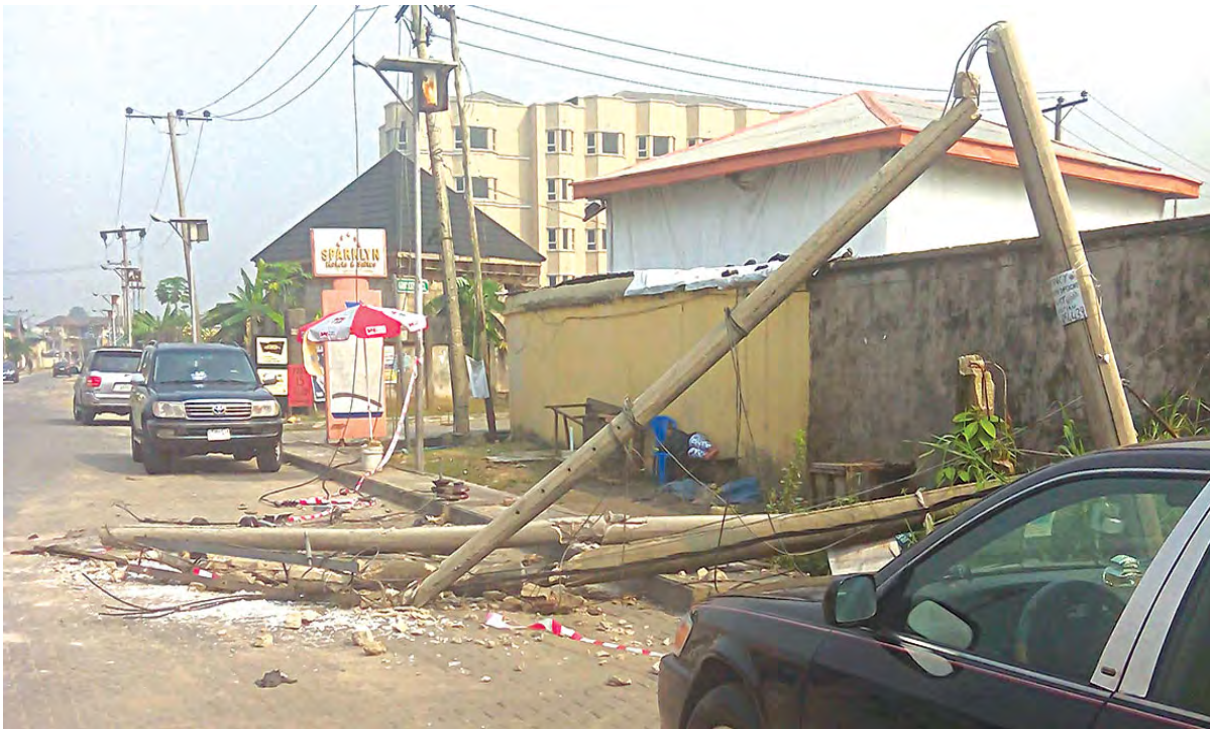
Figure 3: Fallen Electricity Poles, a Common Sight in Some Communities in Nigerian Universities