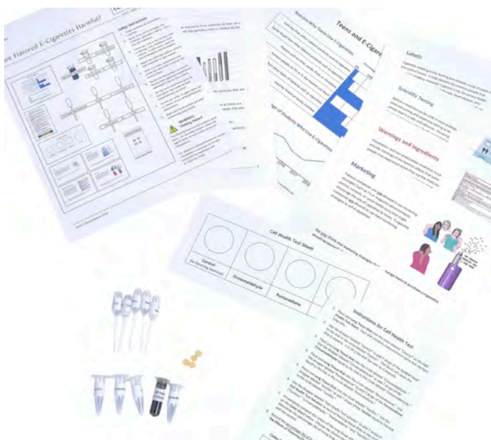
Figure 3. Are Flavored E-Cigarettes Harmful? Kit materials.

The kit is designed to engage participants in learning the following concepts: