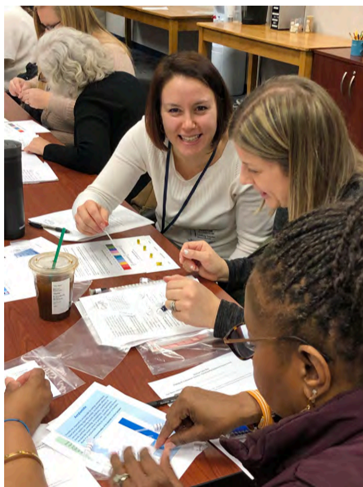
Figure 4. Are Flavored E-Cigarettes Harmful? Teacher workshop pre-COVID-19.

Pre-COVID-19 (before March 2020), the Are Flavored E-Cigarettes Harmful? kit was used by classroom teachers in high school and middle school science and health classes. The kit was also used in school-based and outreach programs for at-risk youth and in professional development workshops for teachers and school staff who work with at-risk youth (Figure 4). Evaluation surveys completed by classroom teachers who field-tested the Are Flavored E-Cigarettes Harmful? kit indicated that this kit had an impact on their students' understanding of the risks associated with vaping/e-cigarettes: