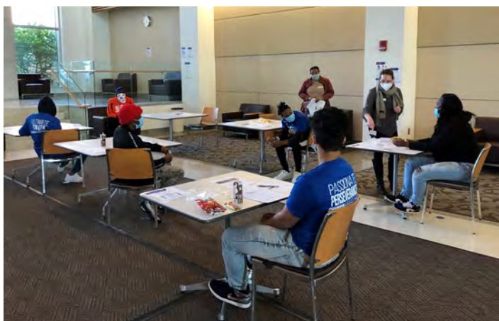
Figure 5. Socially-distanced kit use.