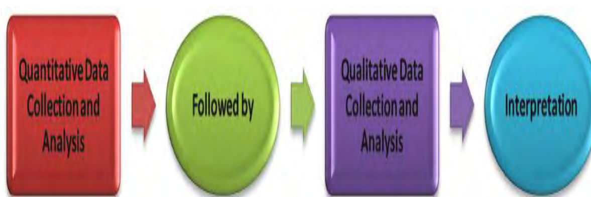
Figure 1. Explanatory Sequential Design

The explanatory sequential design was the mixed research design of choice in this study to ensure that participants understood the research questions. The explanatory sequential design consists of two stages: qualitative and quantitative (Creswell & Plano-Clark, 2015). In the first stage, quantitative data are collected, and statistical tests are used to overview the subject of interest. In the second stage, qualitative data are collected and analyzed based on quantitative results. The qualitative data helps the researcher explain and enrich the quantitative data (Creswell, 2009). Figure 1 shows the path diagram of the design.