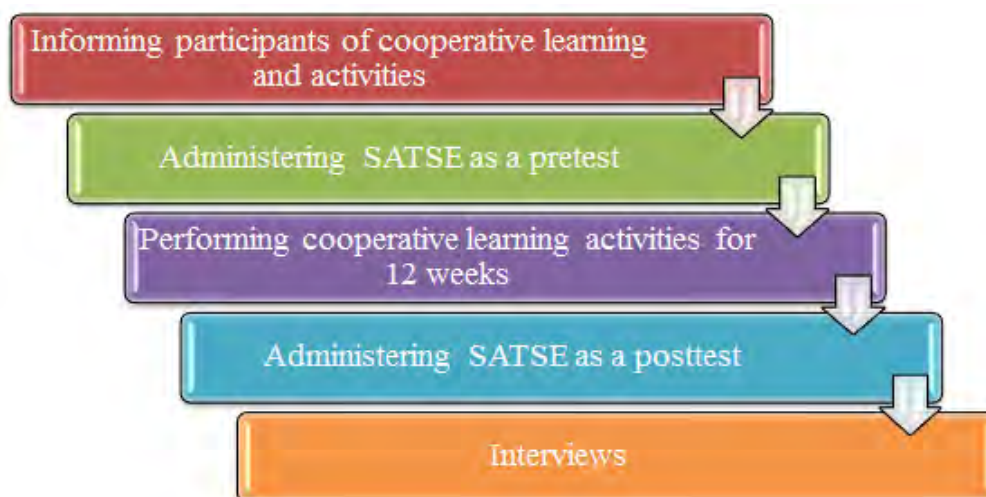
Figure 2. Research Process for the Experimental Group