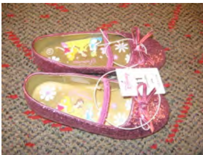
Photo of Princess Sparkly Shoes