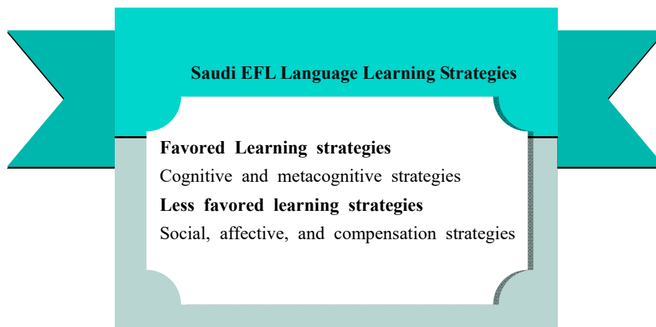
Figure 2. Saudi EFL Language Learning Strategies

To address Saudi EFL students' infrequent use of learning strategies and their failure to use the full range of strategies, teachers need to provide additional and more frequent opportunities for students to use appropriate language-learning strategies in different instructional tasks and activities. Moreover, the language strategies students were found to use least frequently, including affective, memory, and compensation strategies, should constitute the core of classroom strategy instruction. Teachers can help students use such strategies effectively by matching their teaching styles to each student's learning style and selecting appropriate instructional methods, tools, and materials to maximise students' use of learning styles and strategies. Ultimately, these measures will enhance the development of Saudi EFL learners' linguistic abilities.