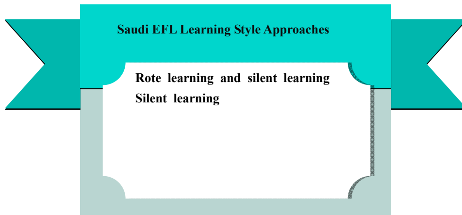
Figure 3. Saudi EFL Learning Style Approaches