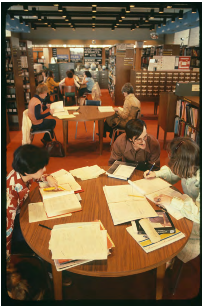
Note. In the 1970s and 1980s, the CRC was a robust and active place in which pre-service teachers studied and researched

located with a card catalog and by browsing the shelves. The CRC was always open to the public, as well as to the college community.