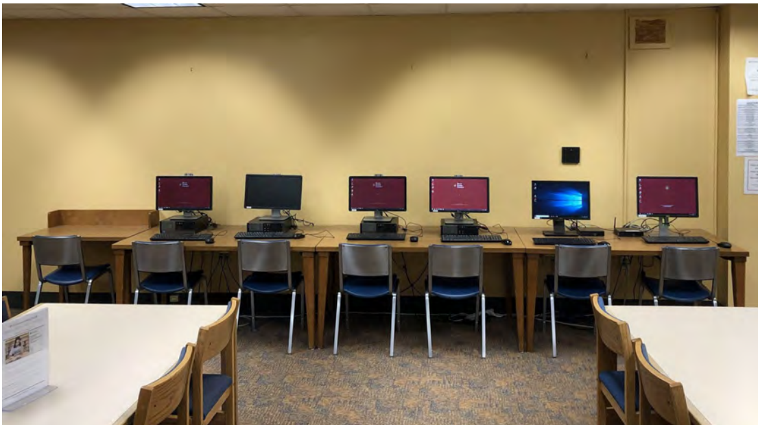
Figure 4: The computer space in the CRC prior to the work of the elementary education class

The elementary education class felt that as the purpose of the Curriculum Resource Center was to promote the teaching of children, it was important to feature artwork made by children in the space. One of the best outcomes of the collaboration between the elementary education class and the library was a mural created by third grade students from a local elementary school to decorate the empty space above the computer terminals seen in Figure 4. The elementary education faculty member introduced the elementary education students to the art teacher and technology education teacher at this school. Together, they worked with a class of third grade students who were studying the work of artists Cy Twombly and Jean-Michel Basquiat. They created a piece of artwork for the redesigned Curriculum Center, based on the graffiti-like and calligraphic styles of these artists. The artwork was created in the elementary school art classroom (see Figure 5) and was hung in the Curriculum Resource Center in the college library over a bay of computers (see Figure 6). In addition to the artwork, new computer tables and chairs were ordered to modernize the space.