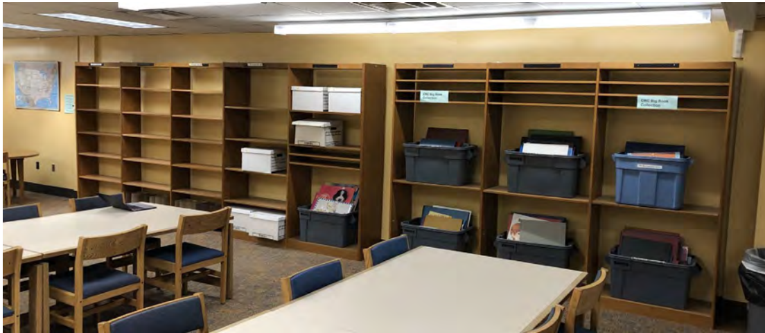
Figure 2: The empty CRC shelves prior to the work of the elementary education class

Fortunately, an alternative solution was developed in the form of book displays by theme which could incorporate both picture and juvenile books together on the same shelf, along with appropriate K-12 non-fiction titles. The elementary education students used additional shelving which was standing empty in another part of the CRC, shown in Figure 2. They developed several book displays, including an Earth Day display, award winning picture books, award winning chapter books, Spanish-language books, and art, history, and science related book displays. Displays were also made for large-print “big books” designed for reading to preschool, kindergarten, and first graders. These displays shown in Figure 3 were a great success and the students were pleased with them as an alternative solution to re-cataloging and re-processing the collections.