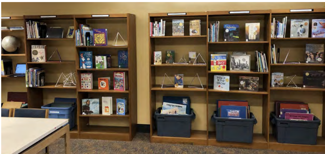
Figure 3: These same CRC shelves after the work of the elementary education class

Fortunately, an alternative solution was developed in the form of book displays by theme which could incorporate both picture and juvenile books together on the same shelf, along with appropriate K-12 non-fiction titles. The elementary education students used additional shelving which was standing empty in another part of the CRC, shown in Figure 2. They developed several book displays, including an Earth Day display, award winning picture books, award winning chapter books, Spanish-language books, and art, history, and science related book displays. Displays were also made for large-print “big books” designed for reading to preschool, kindergarten, and first graders. These displays shown in Figure 3 were a great success and the students were pleased with them as an alternative solution to re-cataloging and re-processing the collections.