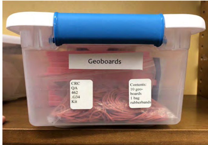
Figure 7: Example kit that was removed from a cardboard box and placed in a clear plastic bin

Additional work was also done with the Jackdaw primary source collections in the CRC. Jackdaw is a publisher of primary source materials which include historical primary source documents, as well as large photographs from historical time periods, broadsheet essays and timelines. The library has many of these themed collections which are of varying sizes from 9" x 14" to 10" x 16". They were not uniformly cataloged. Some were cataloged as kits and others as visual files or books. Circulation on all was